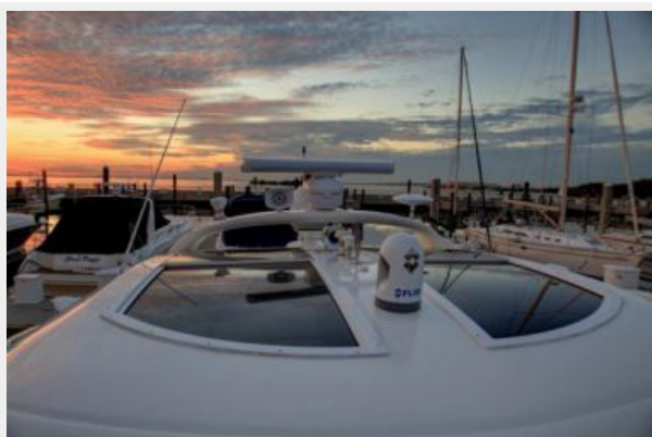
FLIR Night Vision System