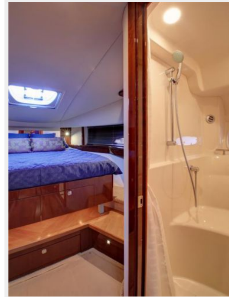
Master Head Shower