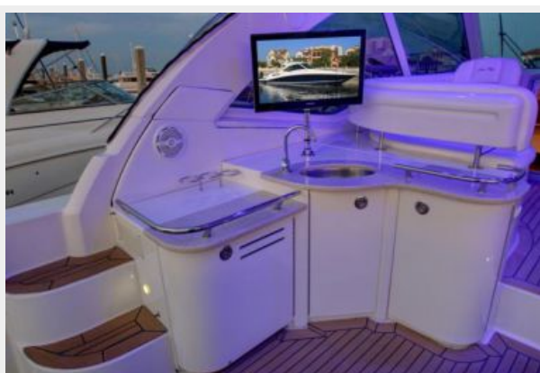
Wet Bar w/Sink to Port