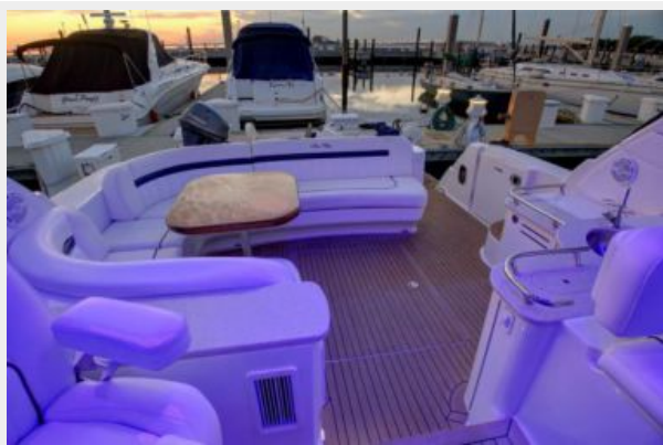
Aft Deck Seating