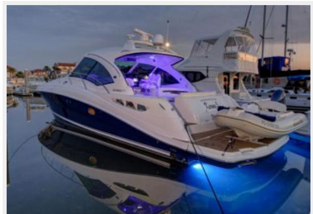
Hydraulic Swim Platform w/Tender