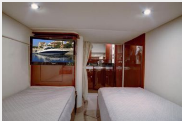
Mid Stateroom (3)