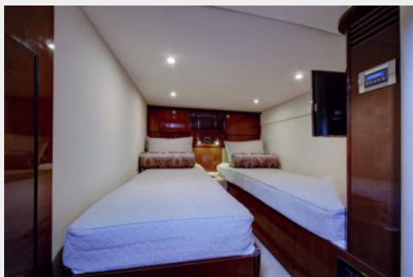
Mid Stateroom Twin Beds w/Slide System- Converts to Queen Bed