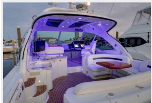
Aft Deck Forward