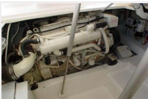
Port Main Engine