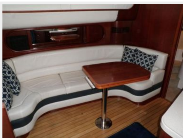
Salon Sofa to Port