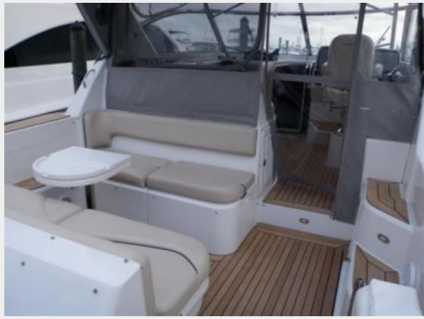
Lower Cockpit 2