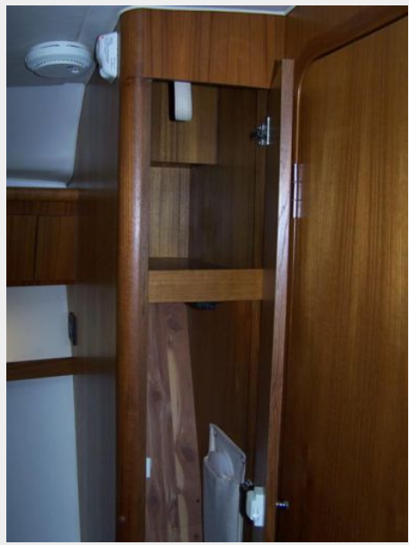
Master Hanging Locker