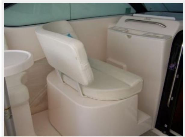
Swivel Companion Seat