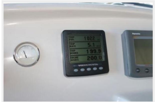
The Other Monitor Gauge