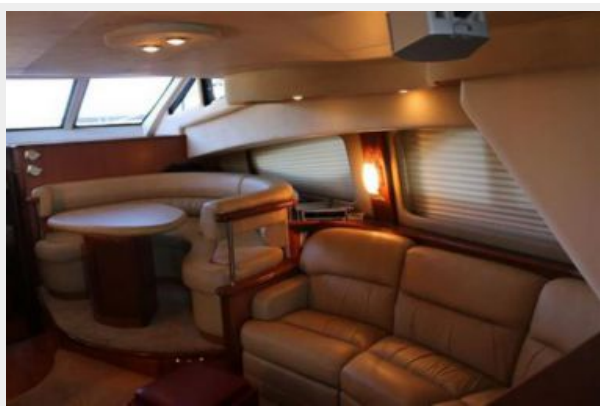
Galley Area looking Forward