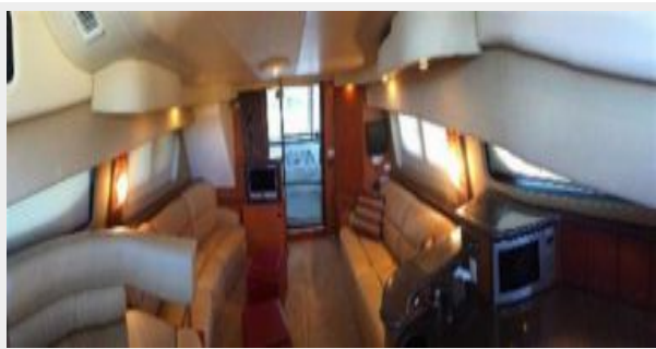
Dinette Seating Area