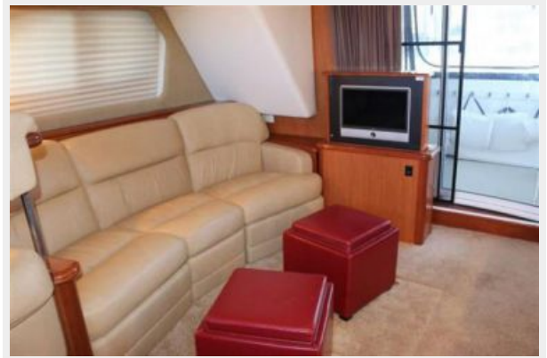
Galley Dinette Seating Area