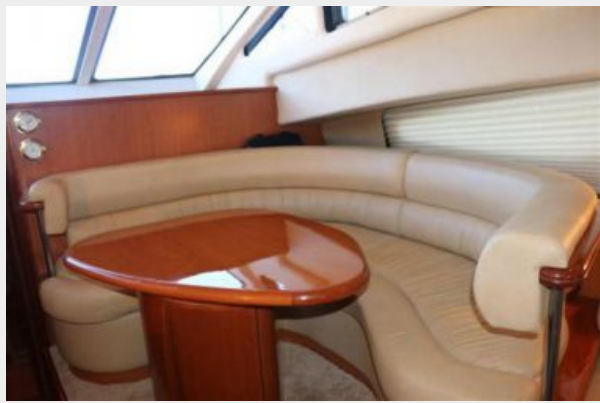
Dinette Seating Area