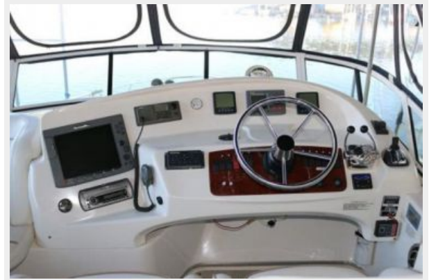
Upper Deck Dash Panel