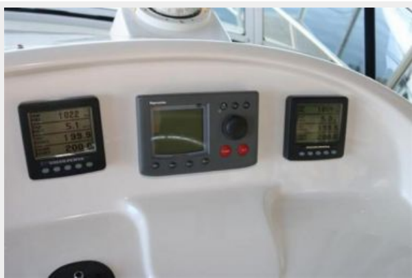
Both Gauges And The Auto pilot