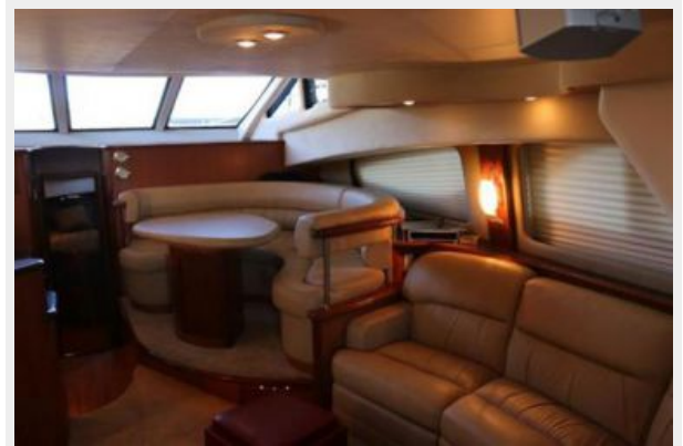
Galley Area looking forward At The Dinette Seating Area