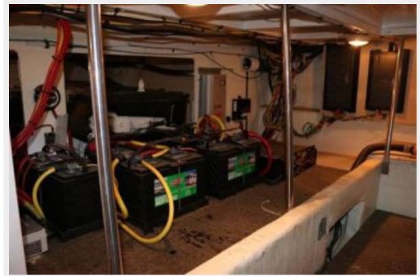
Bilge Area Batteries