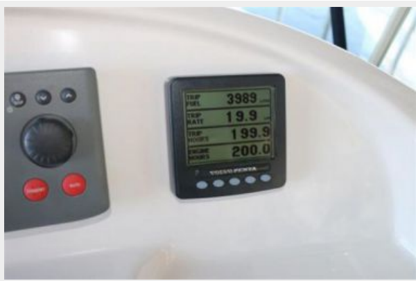
Engine Monitor Gauges