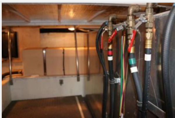
Fuel Tank Area Shut Off Valves