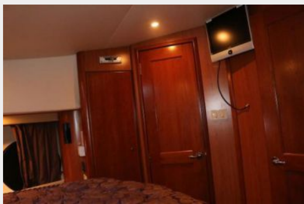
Master looking at the Closet