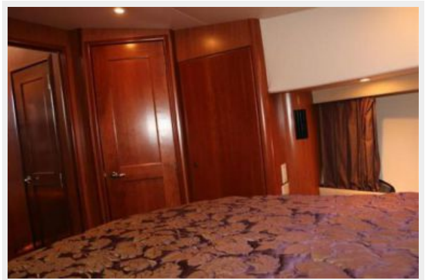
Master State Room