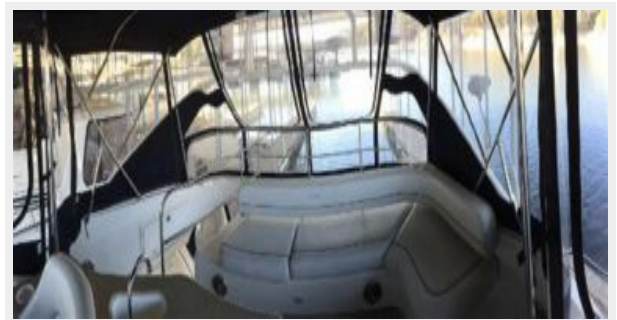
Aft Deck Area