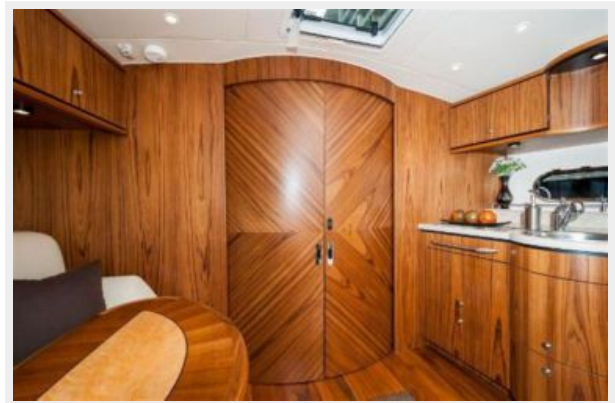
Forward Berth Doors