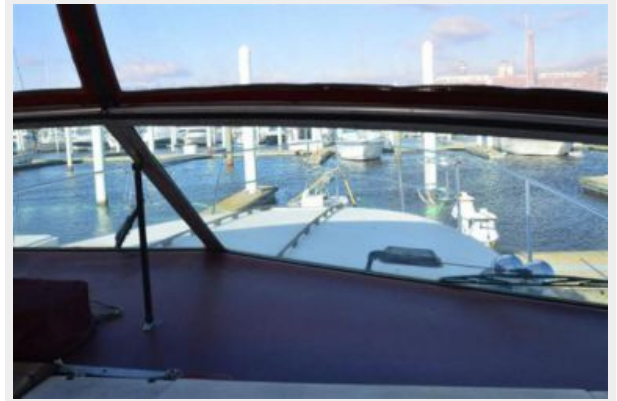
View from Helm