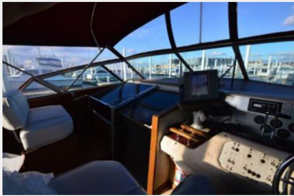
Helm and Companion Seat