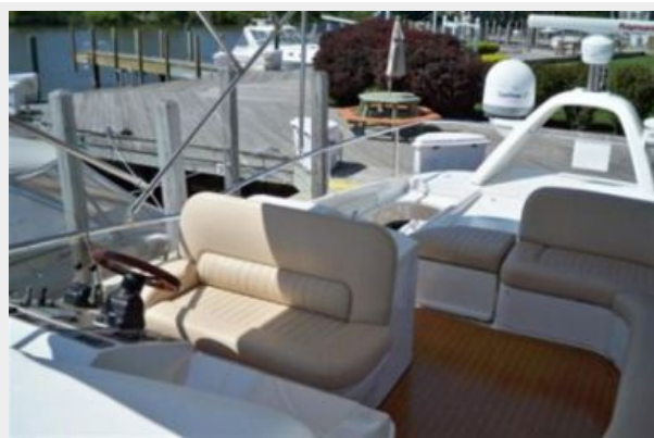
Flybridge Helm Seat