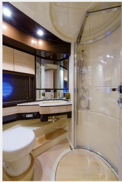
Guest cabin 1 head