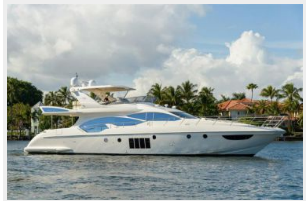
2011 Azimut 70 OUR TRADE