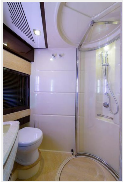
VIP cabin head