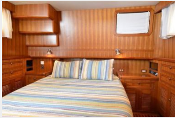
Master Stateroom looking aft