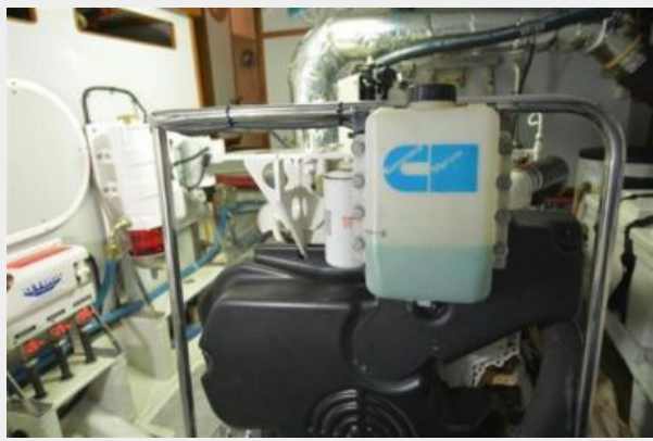
Engine room- Looking aft