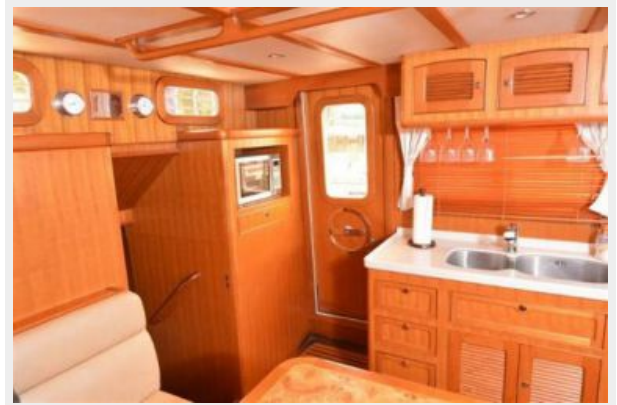
Salon looking port