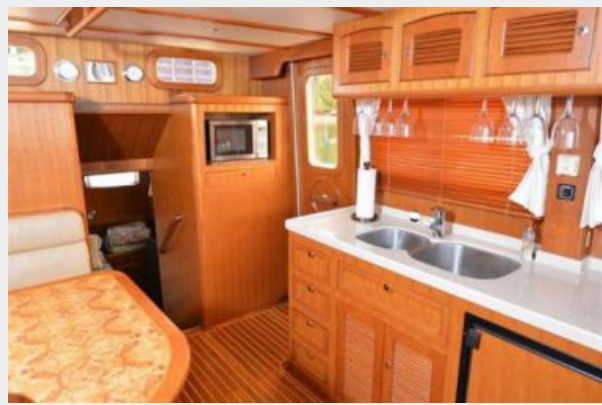
Salon looking port aft