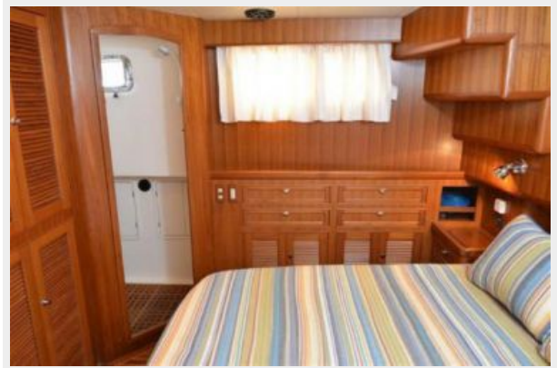
Master Stateroom- looking starboard