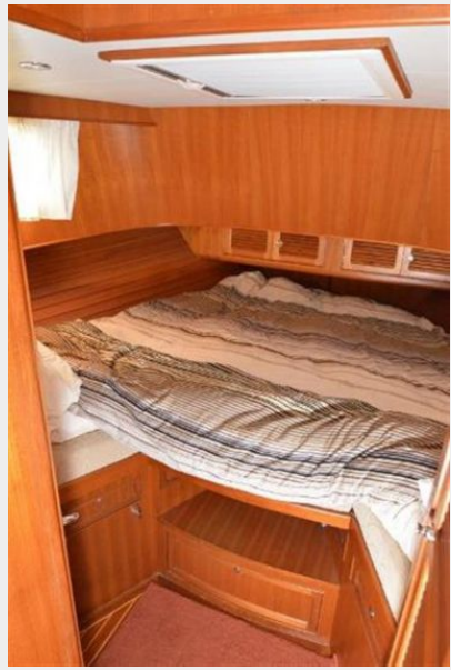
Guest Stateroom- Vee berth with filler