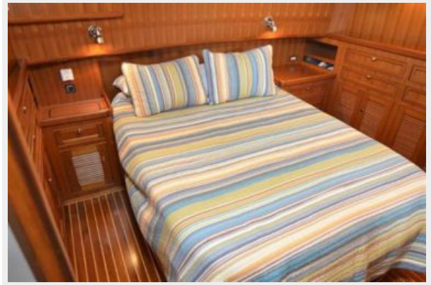
Master Stateroom- looking port