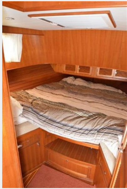
Guest Stateroom- Vee berth with filler