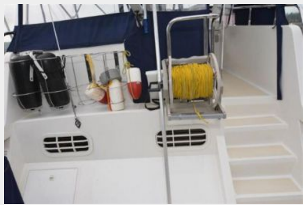
Aft deck looking forward