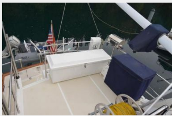
Aft deck with cockpit down three steps