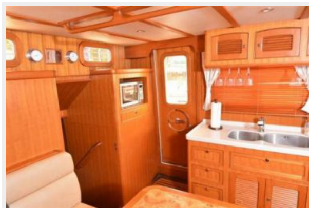
Salon looking port