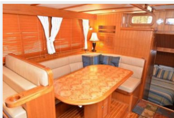
Dinette to starboard