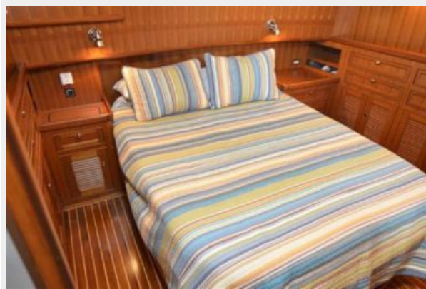
Master Stateroom- looking port