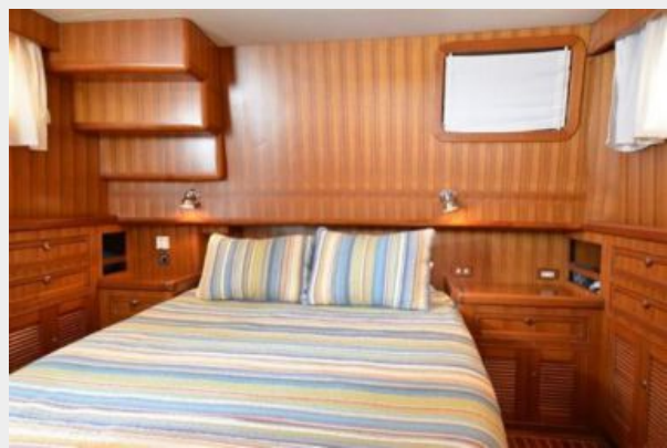
Master Stateroom looking aft