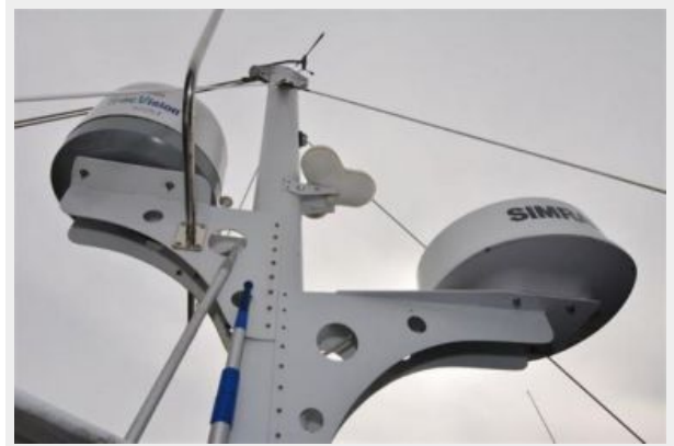
Mast with electronics