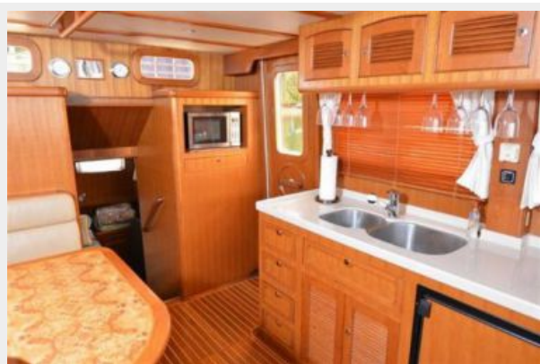
Salon looking port aft