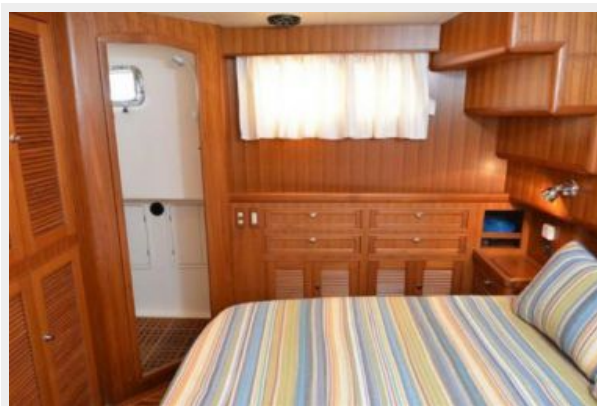
Master Stateroom- looking starboard