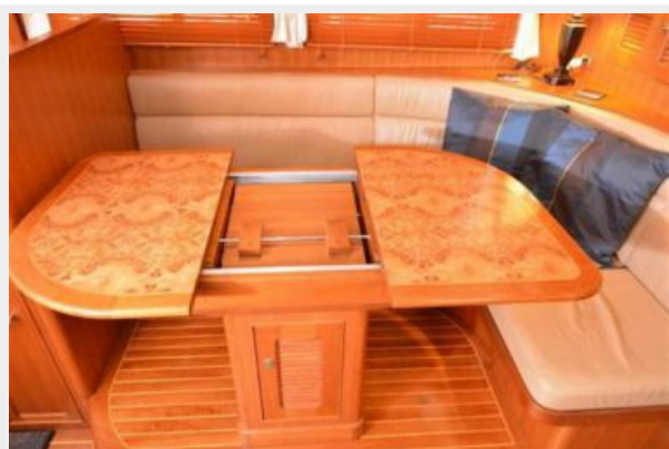
Open to add a leaf