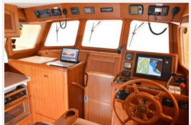
salon looking forward and to port