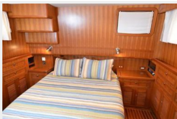
Master Stateroom looking aft