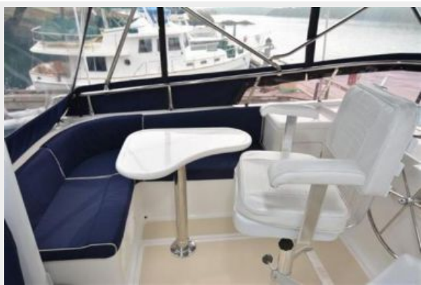
Flybridge looking port