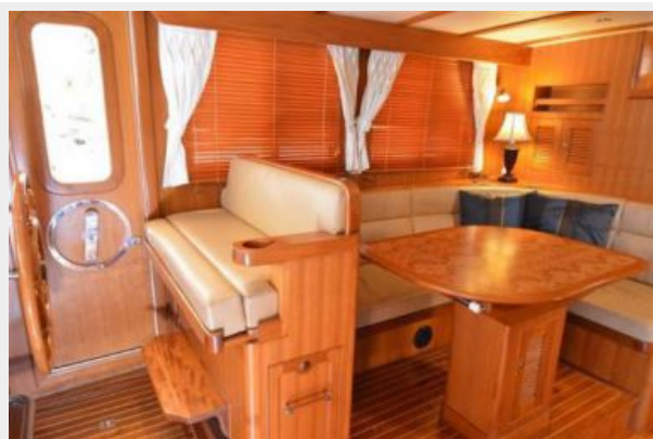
Salon looking starboard