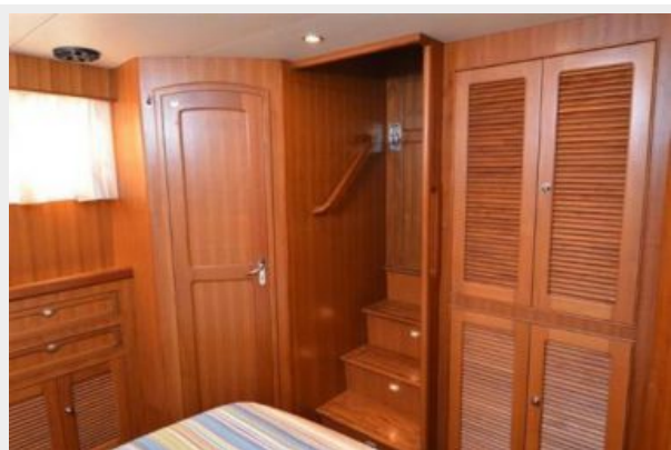
Master Stateroom- looking forward