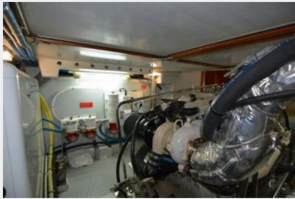
Engine room- looking to port