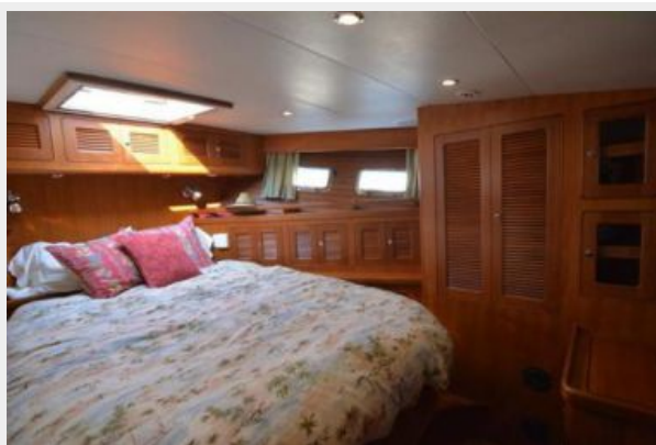
Master Stateroom- looking starboard