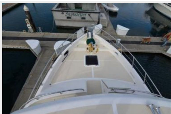
Looking forward to foredeck