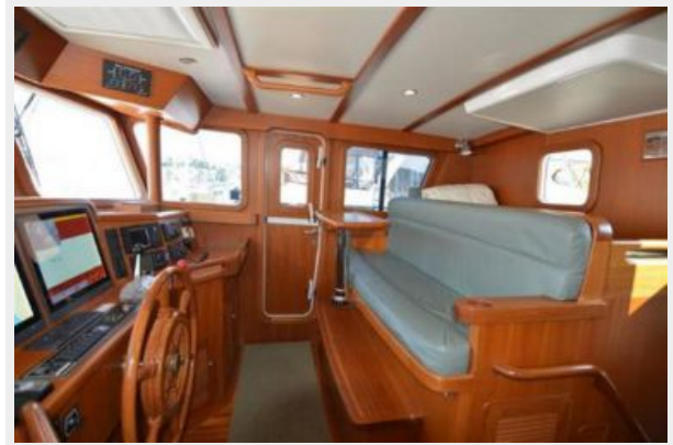
Pilothouse looking starboard