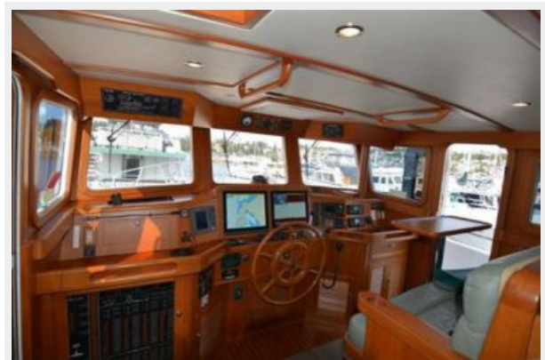
saloon looking port aft