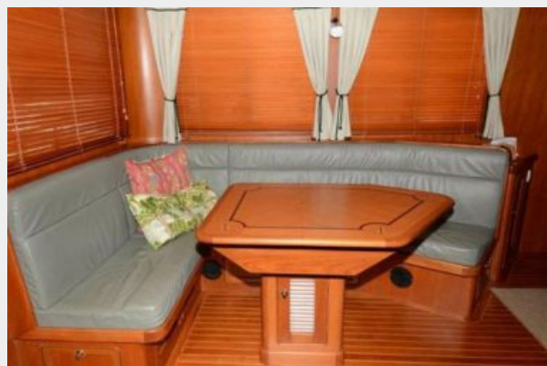
L shaped settee with hide a leaf table