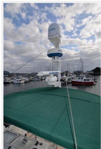
Bimini and Mast