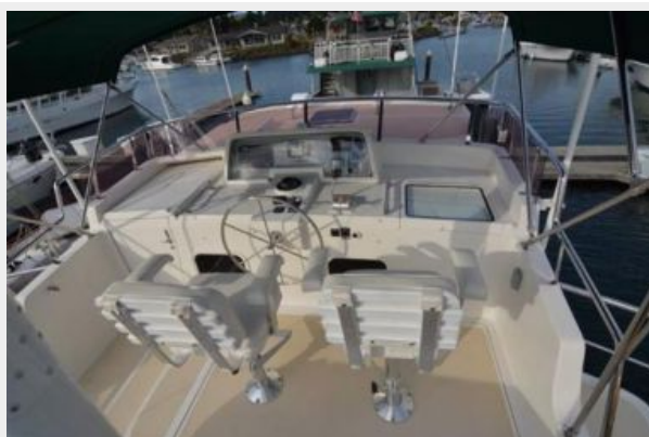
Flybridge looking forward