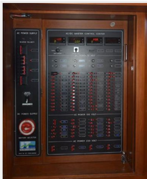
Selene electrical distribution panel