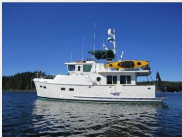
Port side at dock