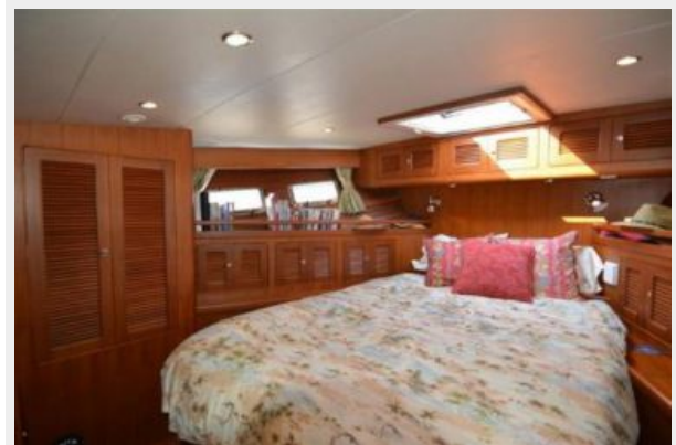
Master Stateroom- looking port