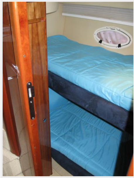
2nd Guest SR