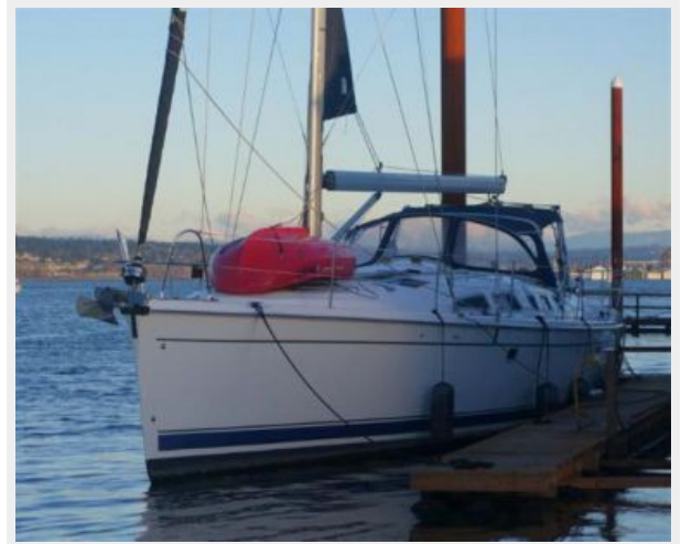
Port Side View