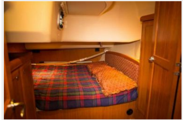
Port Aft Cabin