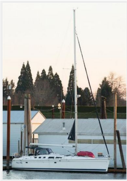
Full View (with Rig)