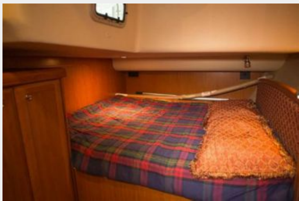
Port Aft Cabin 2