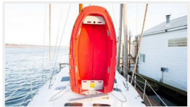
Tender - Portland Pudgy