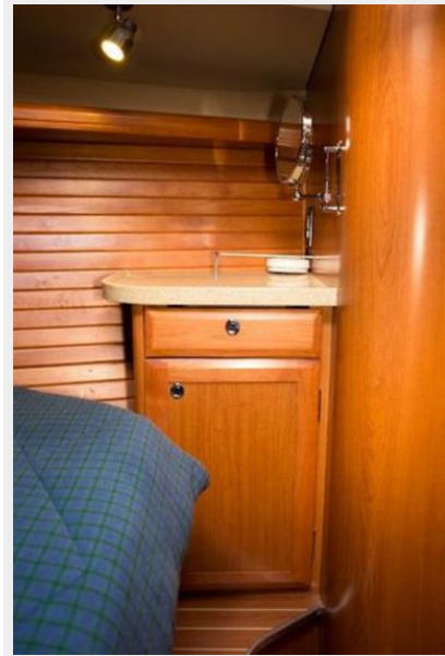
Fwd cabin (Starboard)