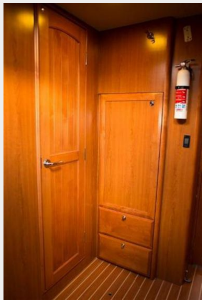
Fwd Cabin (Starboard) 2