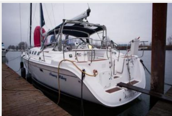
Port Aft View