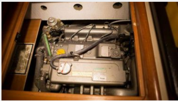
Engine - Yanmar 110HP