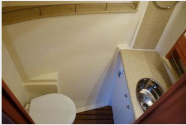
Fwd Cabin Head 2