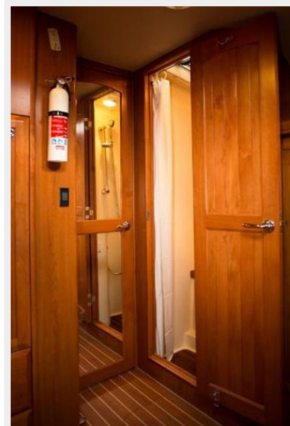
Fwd Cabin - Shower Stall