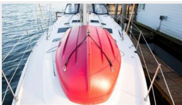
Portland Pudgy Tender