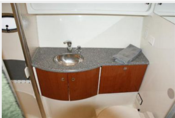
head and fully enclosed shower aft