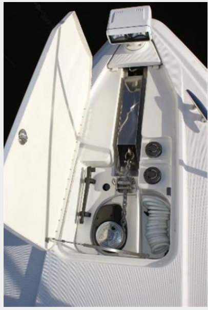
windlass and bow locker detail