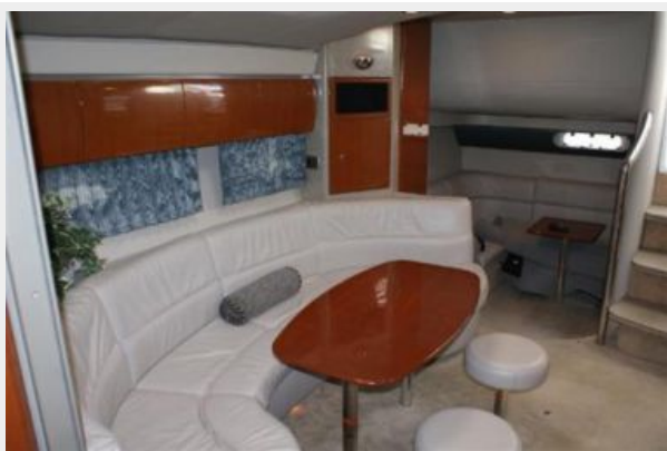
salon settee and table with removable stools