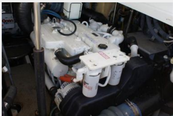
starboard Cummins QSB 5.9