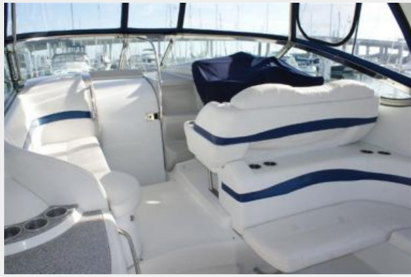
cockpit starboard forward