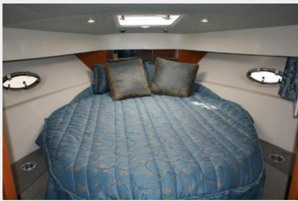
master with centerline queen