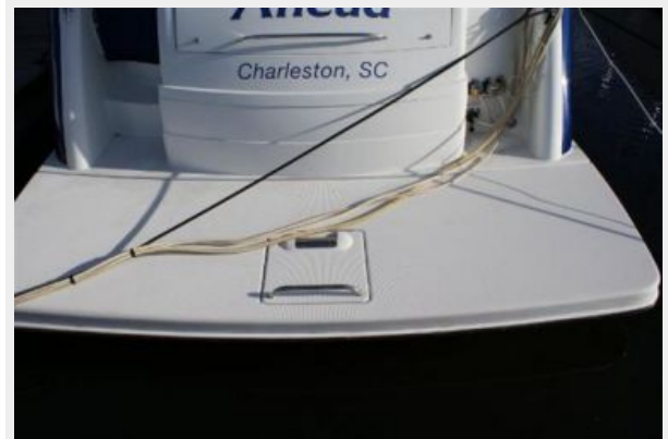
swim platform detail