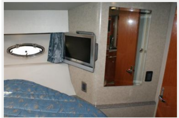
master to starboard