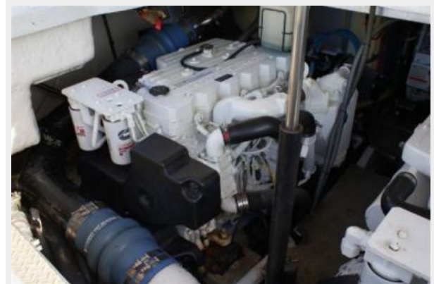
port Cummins QSB 5.9