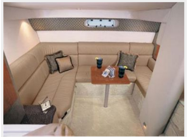
aft cabin manufacturer photo