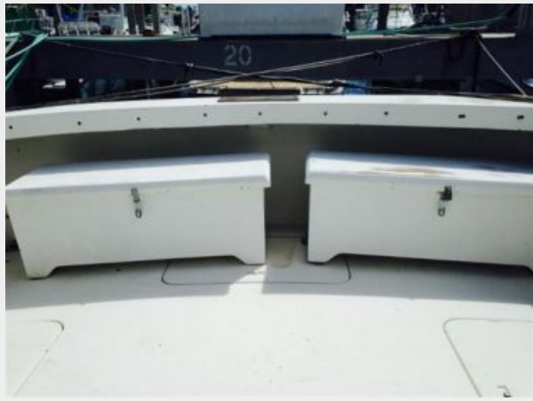
Deck Boxes in cockpit