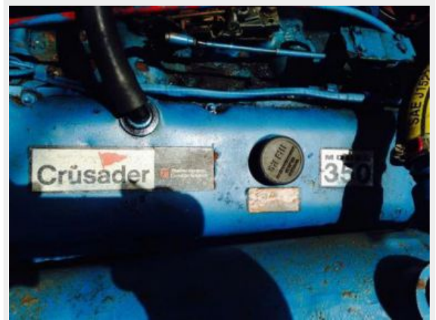
Crusader Model 350