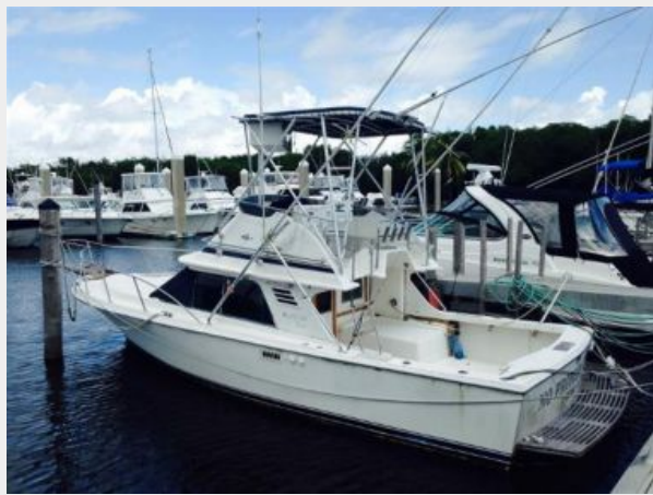
Blackfin 29' Flybridge