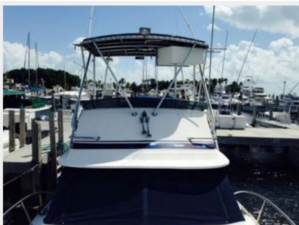
Looking Aft to Bridge with Hardtop