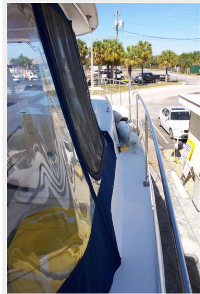
Port Side Deck Aft