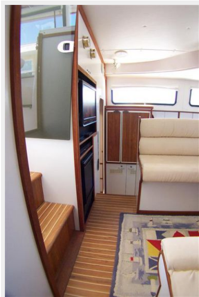
Entrance into Salon