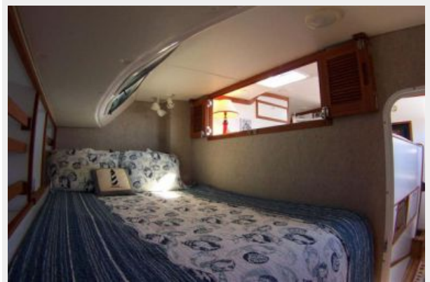
Plenty of Light or Privacy