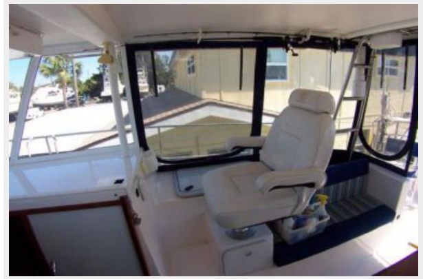
Adjustable Admiral Seat