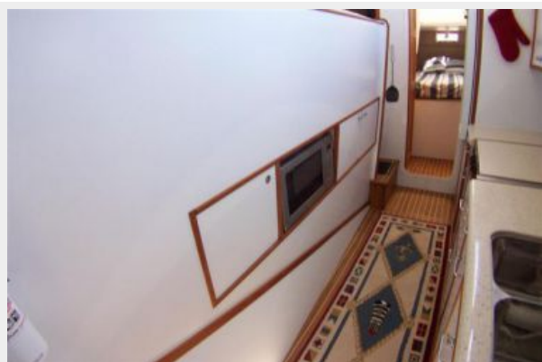
Galley Aft to Guest Stateroom