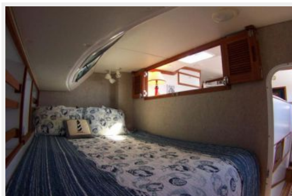
Plenty of Light or Privacy