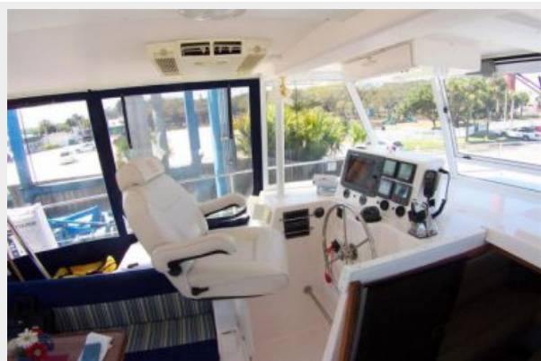
Helm with Great Visibility