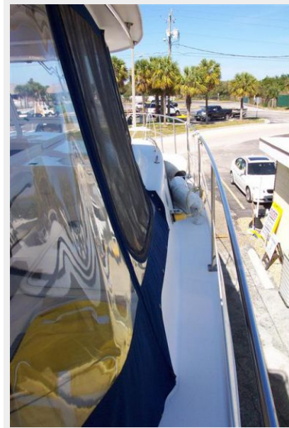
Port Side Deck Aft