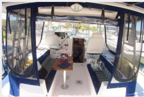
Comfortable Florida Room!