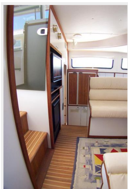
Entrance into Salon