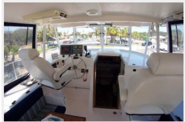
Helm Area Forward