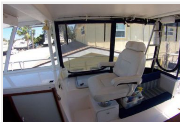
Adjustable Admiral Seat