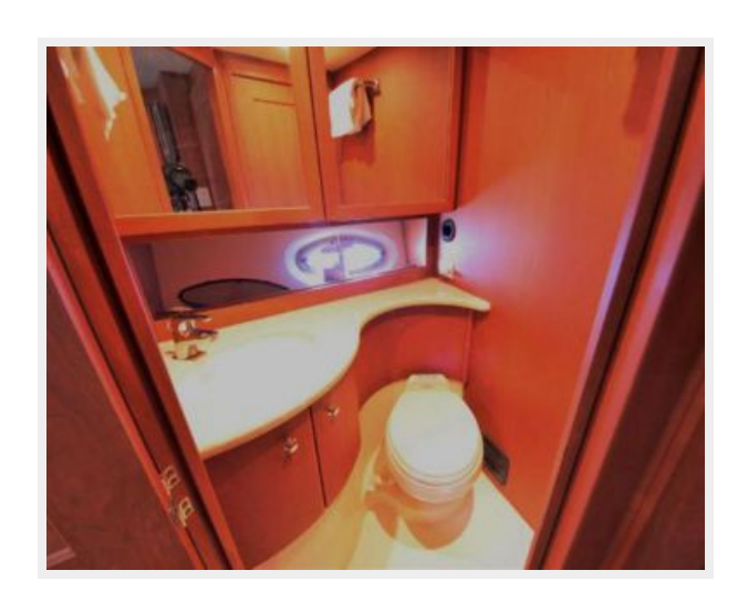
Silverton 38 Guest's Stateroom