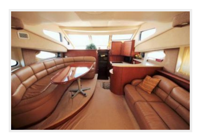
Silverton 38 Port Salon