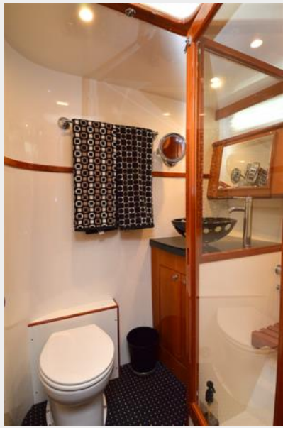
Guest Stateroom Head