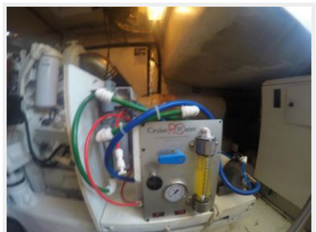
Additional portable water maker