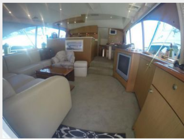
Large Salon and settee