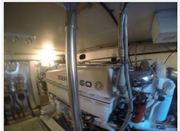
Starboard Series 60 Detroit