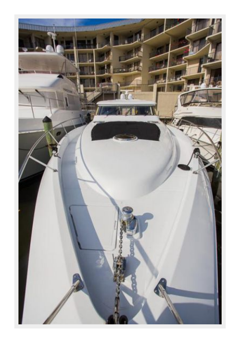
Forward Deck, looking aft