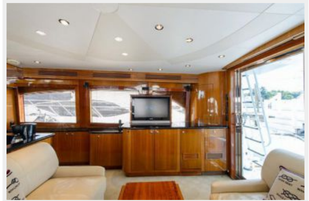
Salon Looking to Starboard