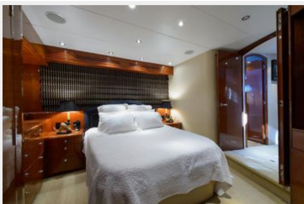
Master Looking to Port