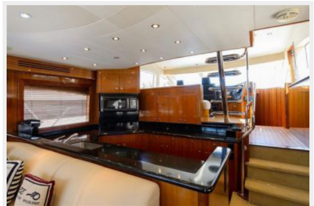
Galley Looking Forward