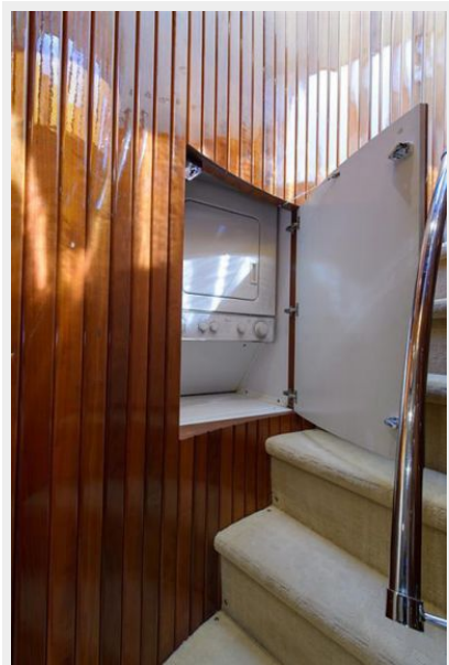
Main Companionway Laundry Area