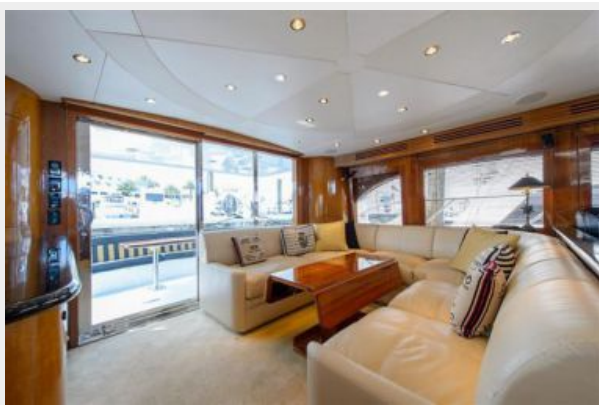
Salon Looking Aft to Port