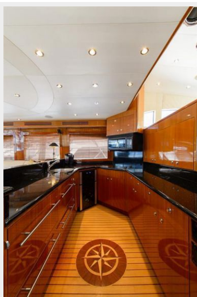
Galley Looking to Port