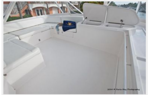
Flybridge looking fwd.