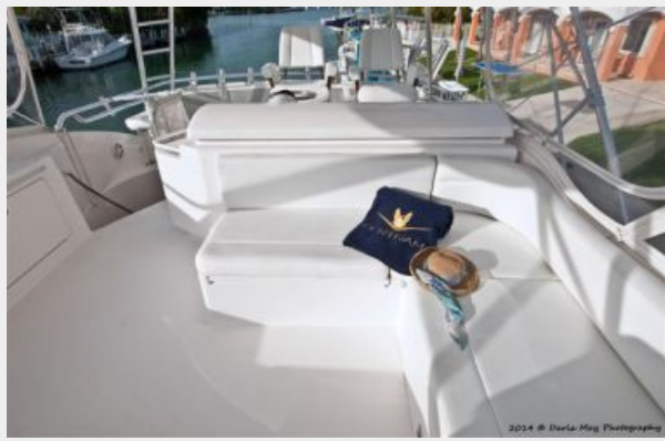
Flybridge looking Aft