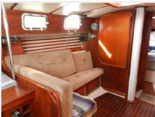
Port Salon Converts to Berth