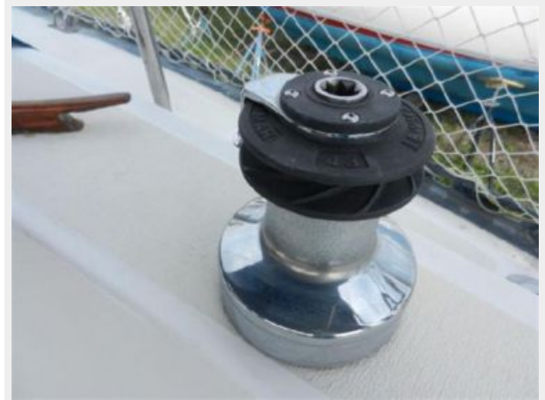
43# Primary Winches