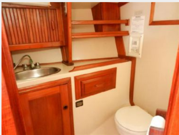
Lextrasen Head and Shower