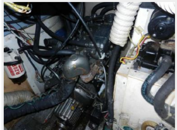
Yanmar 20 hp 1150 hours rear view