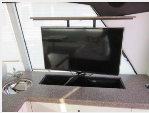
Salon-Upper Starboard Side