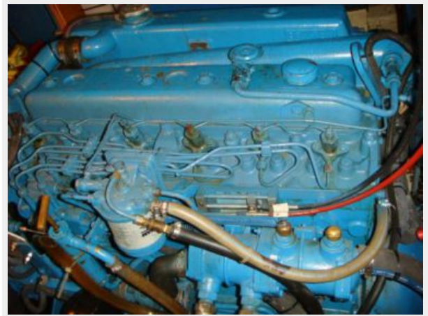
46' Roberts main engine