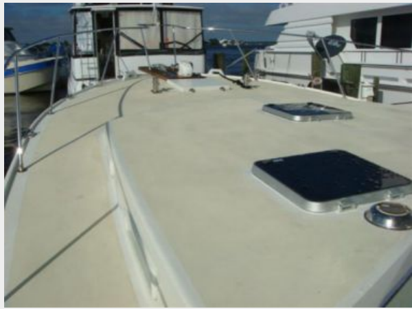
46' Roberts foredeck