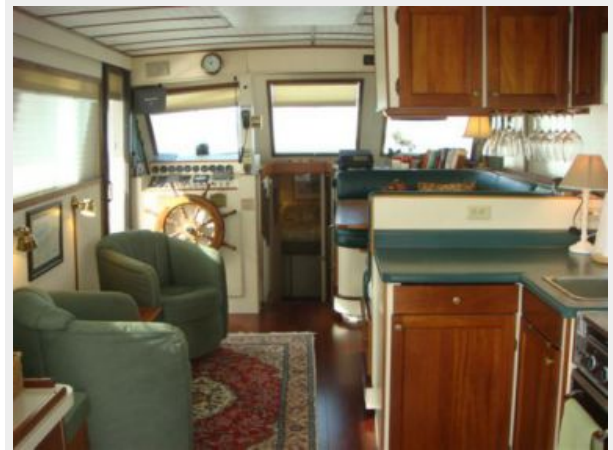
46' Roberts salon forward