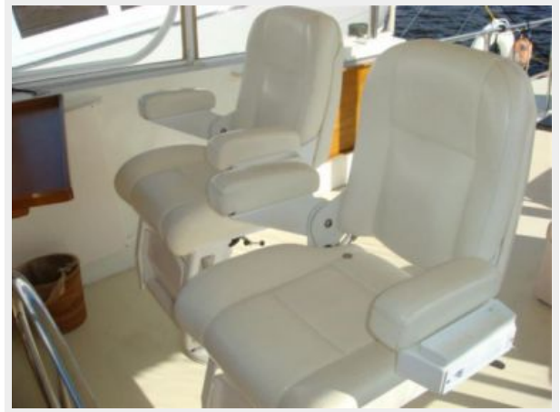
46' Roberts flybridge helmseats