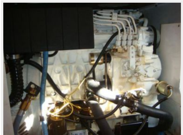
46' Roberts generator