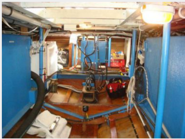
46' Roberts engine room aft