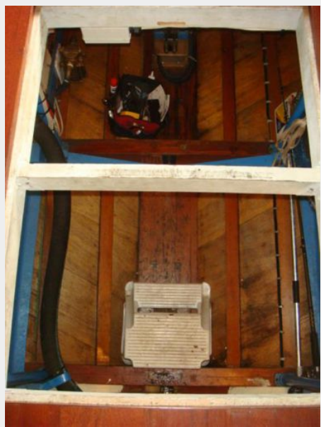
46' Roberts engine room