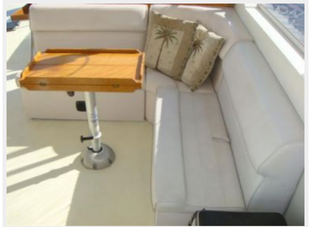
46' Roberts flybridge seating photo2