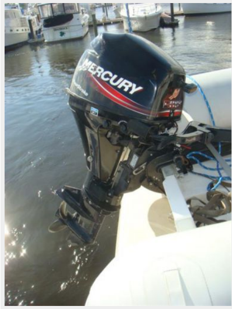
46' Roberts tender outboard