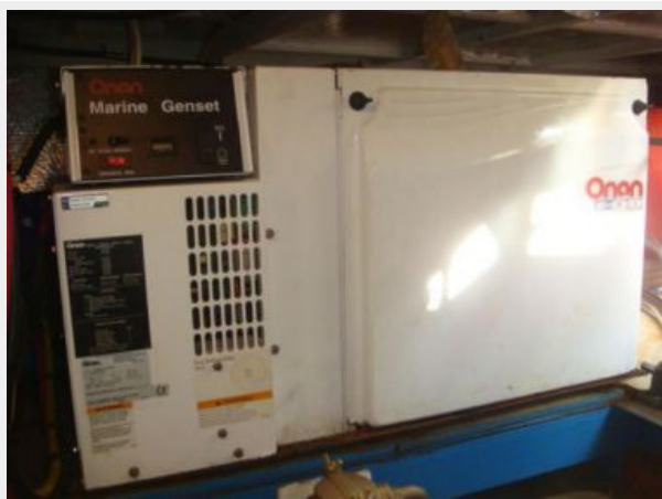
46' Roberts generator sound box