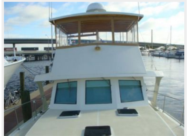
46' Roberts foredeck aft