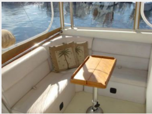
46' Roberts flybridge seating photo1