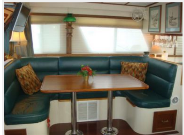
46' Roberts salon settee photo1