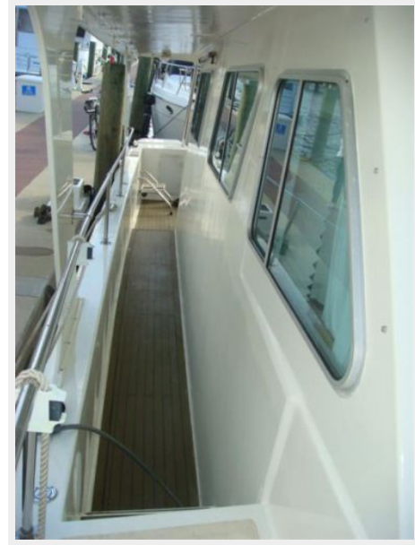
46' Roberts starboard side deck photo2