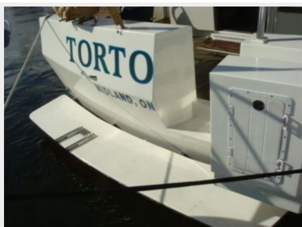
46' Roberts swimplatform