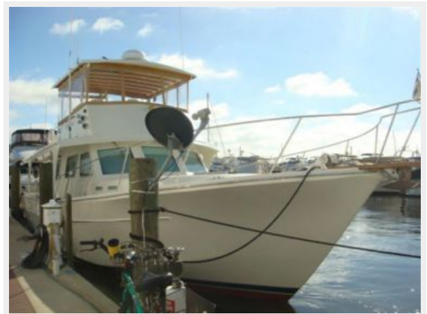
46' Roberts starboard forward profile