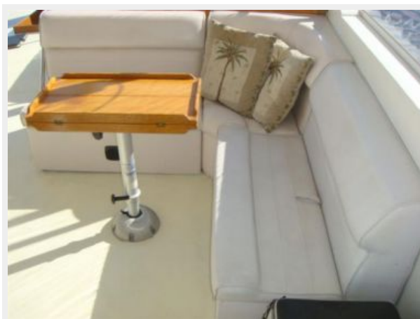
46' Roberts flybridge seating photo2