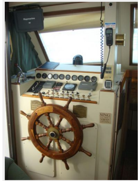
46' Roberts lower helm