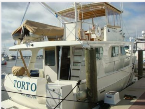
46' Roberts starboard aft profile