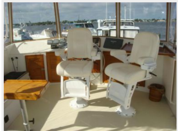
46' Roberts flybridge forward photo2