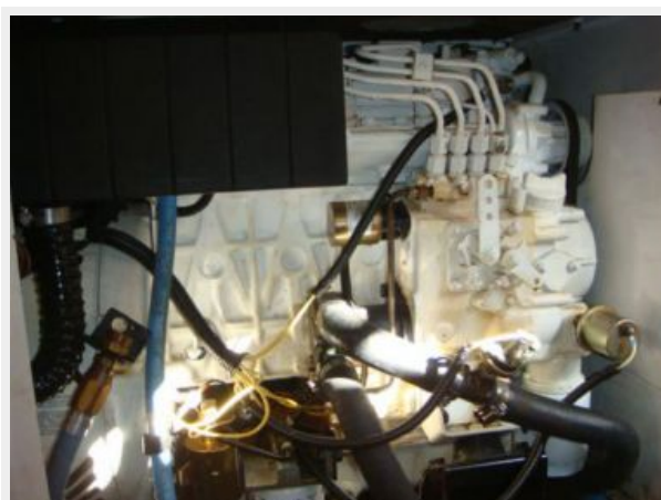
46' Roberts generator