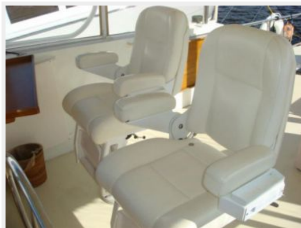
46' Roberts flybridge helmseats