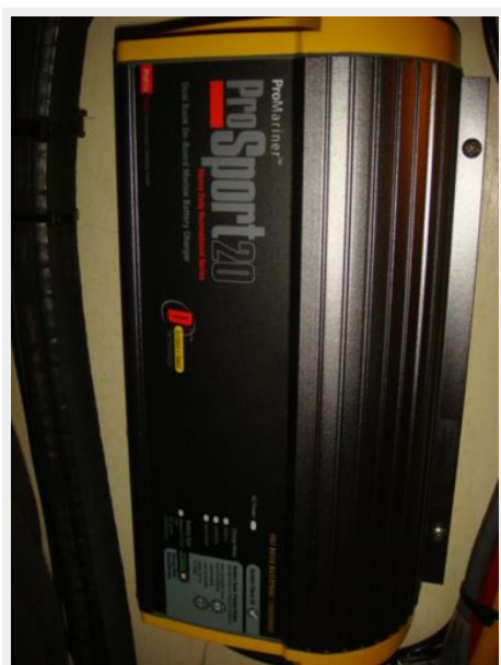
46' Roberts battery charger