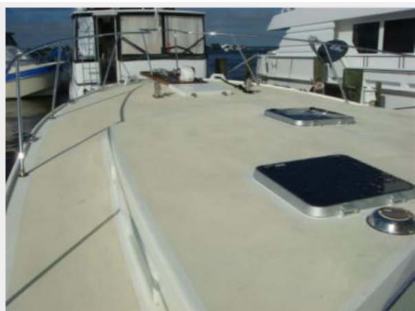
46' Roberts foredeck