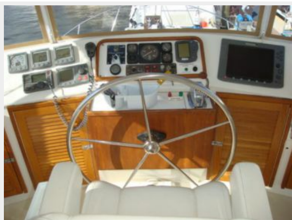
46' Roberts flybridge helm