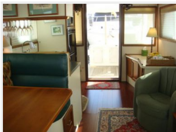
46' Roberts salon aft