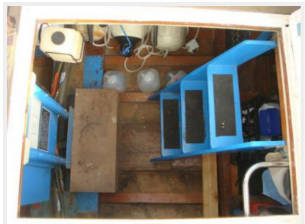
46' Roberts lazarette