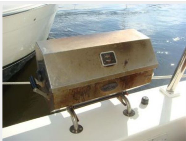
46' Roberts aftdeck BBQ grill