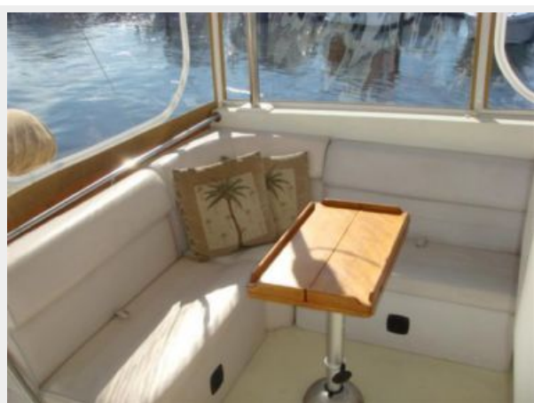
46' Roberts flybridge seating photo1