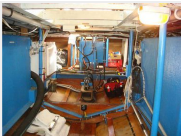
46' Roberts engine room aft