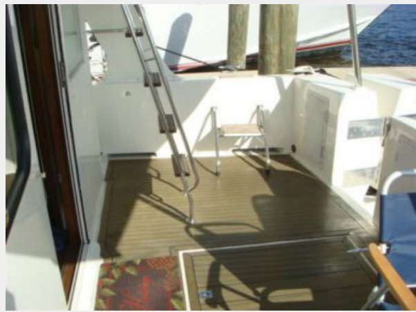
46' Roberts aftdeck starboard