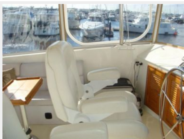
46' Roberts flybridge port