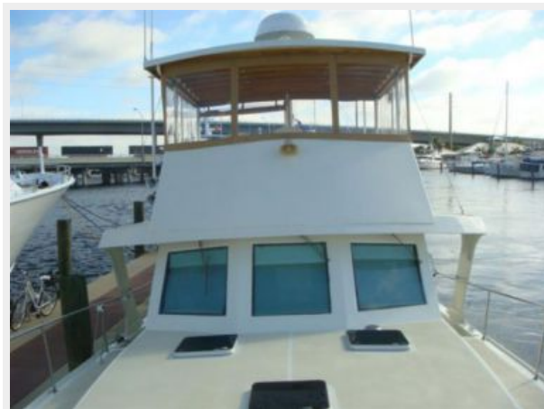
46' Roberts foredeck aft