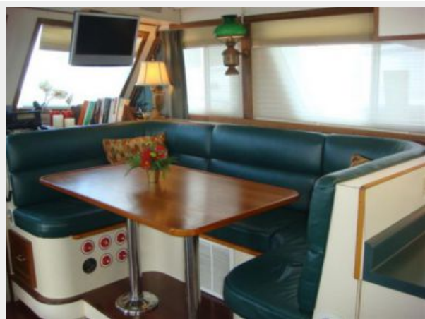
46' Roberts salon settee photo2