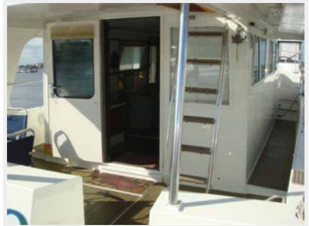
46' Roberts aftdeck forward