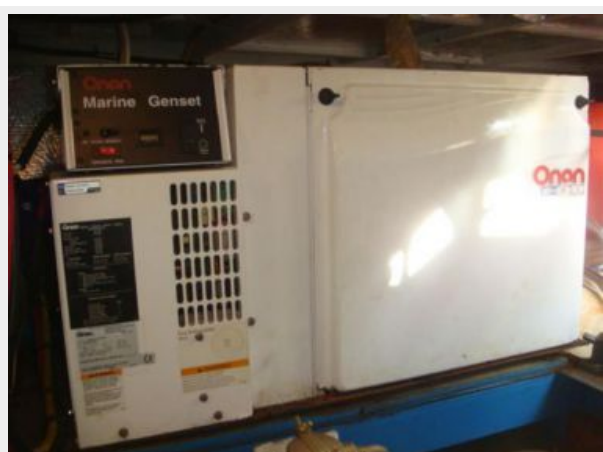
46' Roberts generator sound box