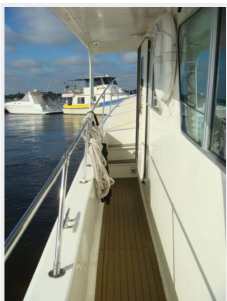
46' Roberts port side deck photo1