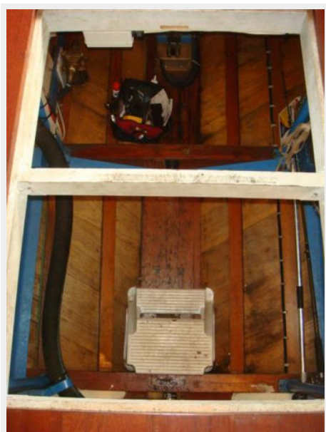
46' Roberts engine room