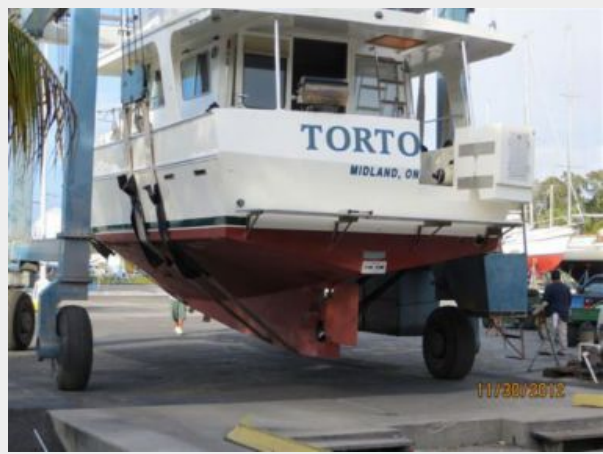
46' Roberts hauled out photo2