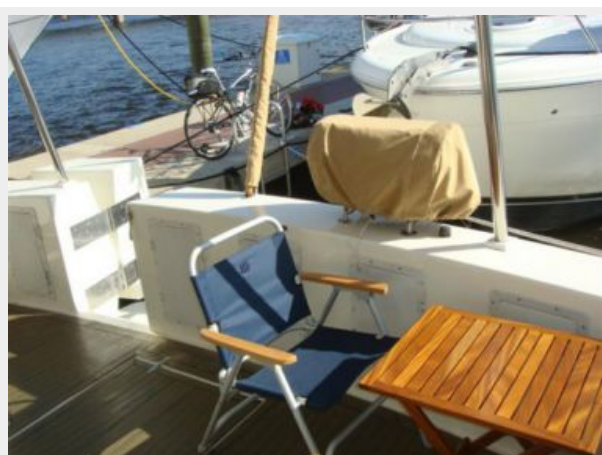
46' Roberts aftdeck