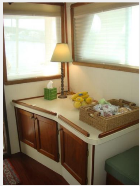
46' Roberts salon port aft