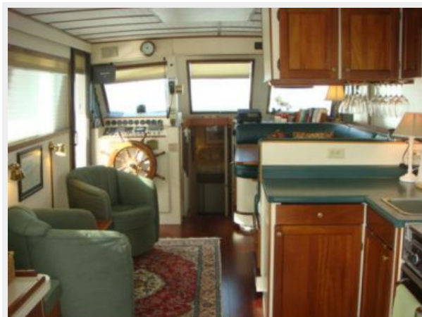
46' Roberts salon forward