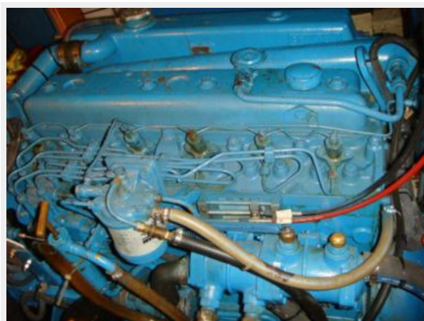
46' Roberts main engine