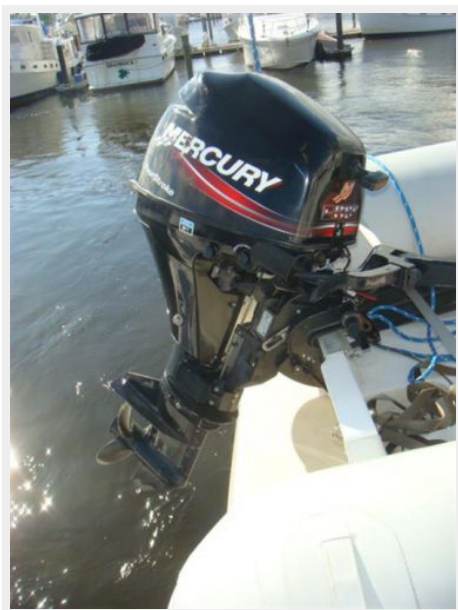
46' Roberts tender outboard