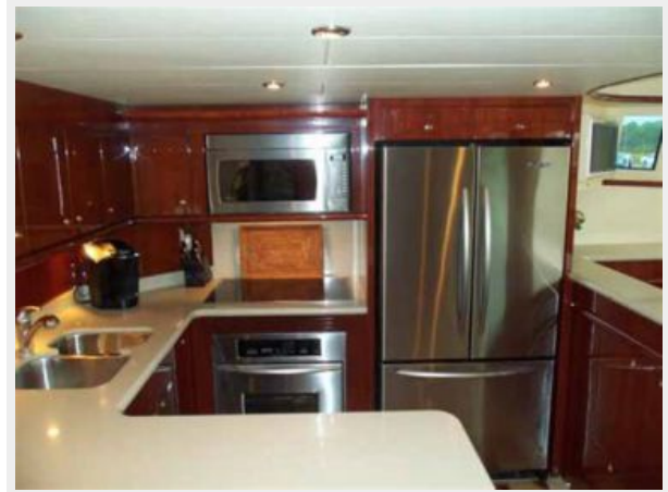
Galley Looking to Port