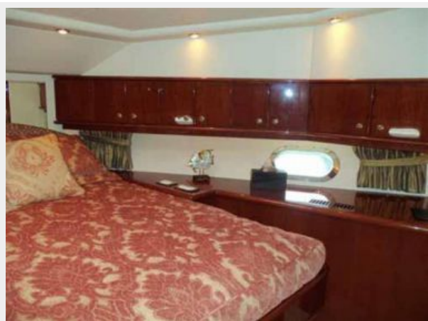
VIP Looking Starboard