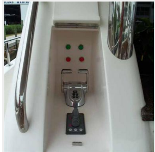
Portside Docking Station