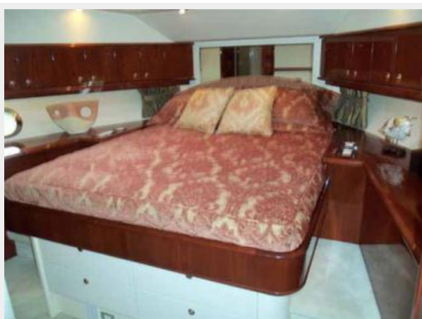
VIP Looking Forward