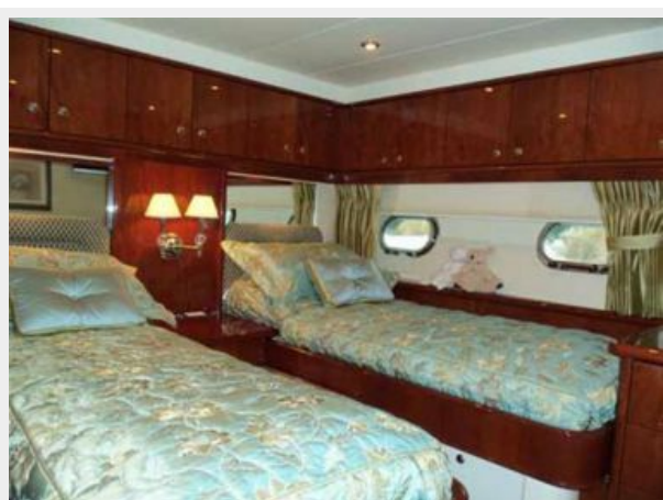
Guest Cabin Looking Aft