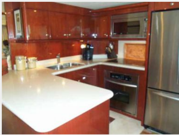
Galley Looking Aft