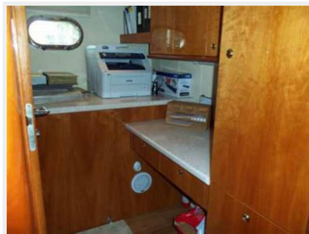
Crew Office Portside