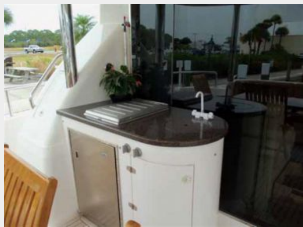
Aft Deck Bar