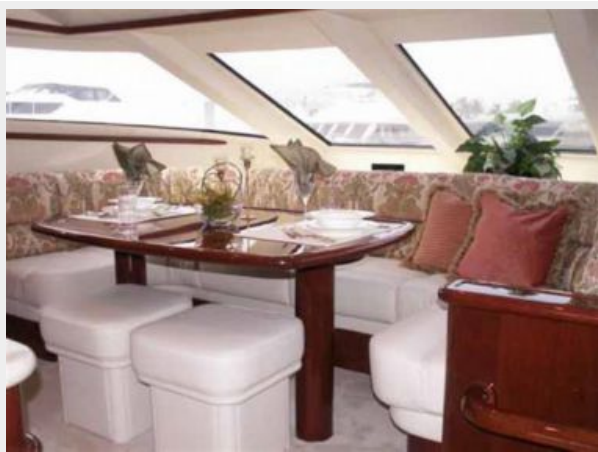
Dining Area Looking Forward