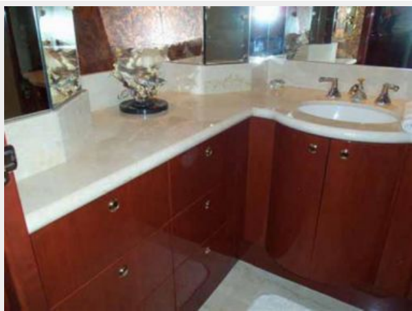
Master Head Looking to Starboard