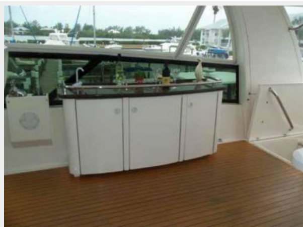
Flybridge Wet Bar