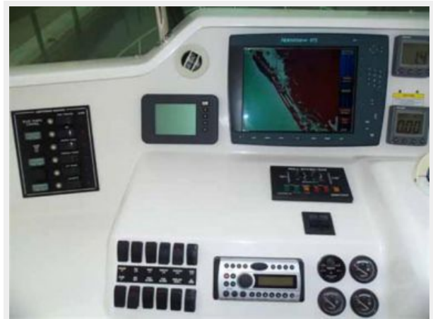
Helm Detail Portside