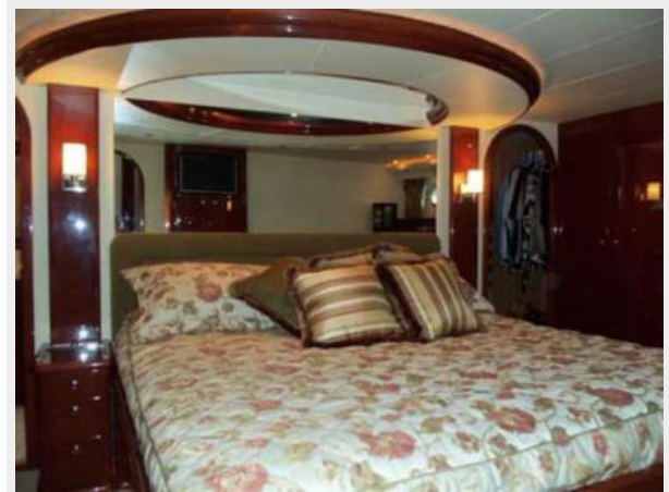
Master Cabin Looking Aft