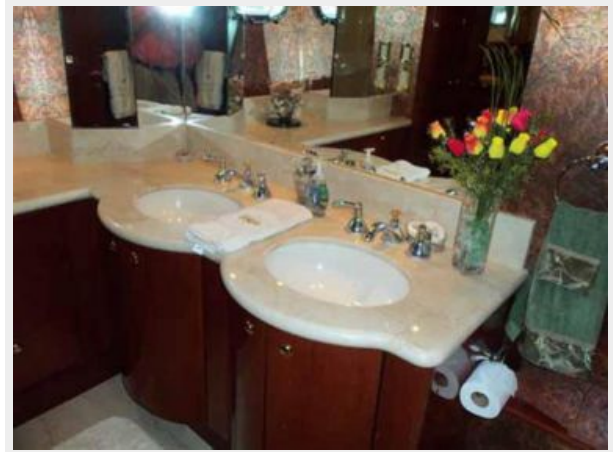
Master Head Looking Aft