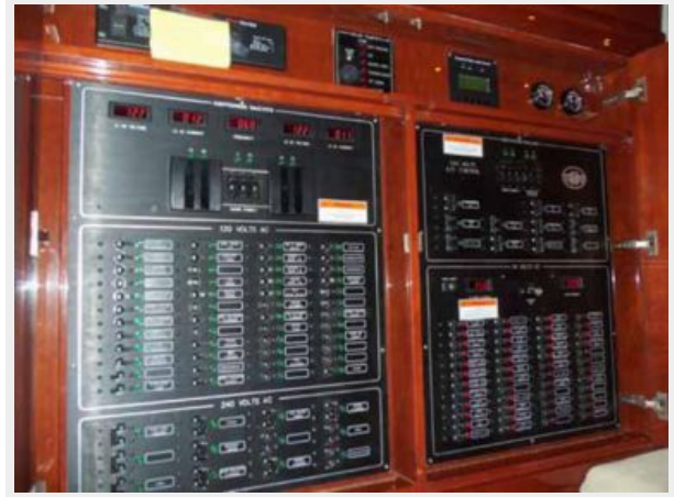
Electrical Locker in Companionway