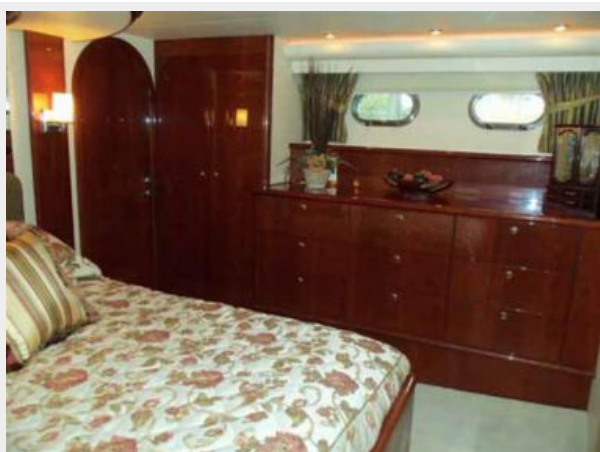
Master Cabin Looking to Port