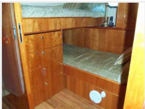
Crew Cabin Starboard Side