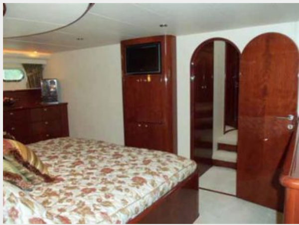
Master Cabin Looking Forward