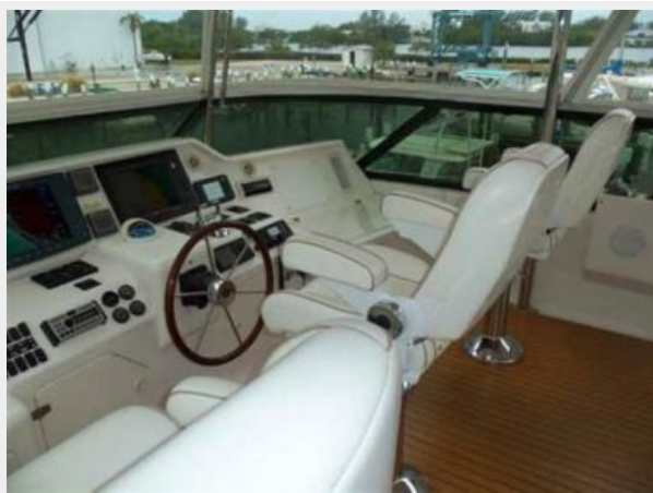
Helm to Starboard