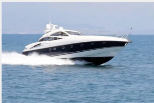
2004 Sunseeker Predator 68 - VAL-R