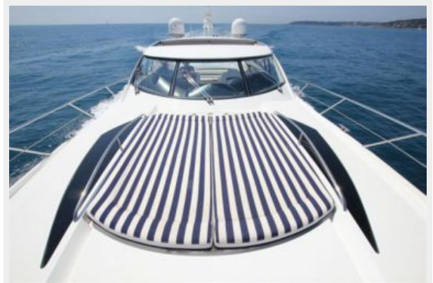
2004 Sunseeker Predator 68 - Foredeck