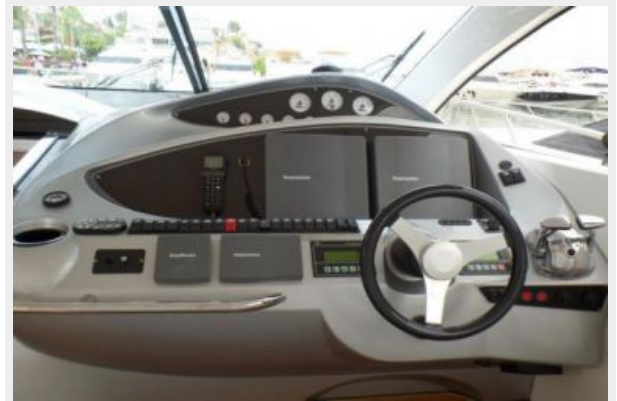
2004 Sunseeker Predator 68 - Helm