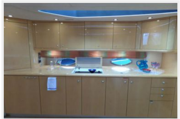
2004 Sunseeker Predator 68 - Galley