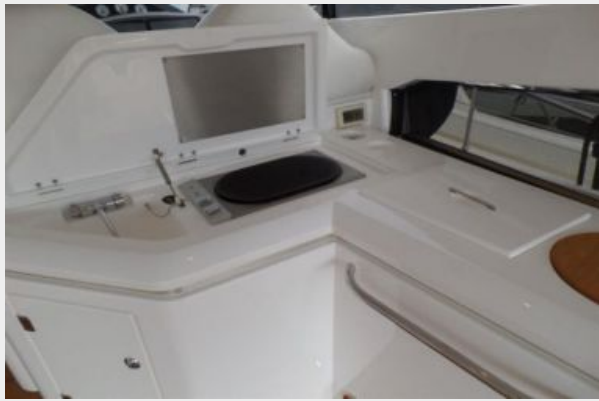
2004 Sunseeker Predator 68 - Aft Cockpit