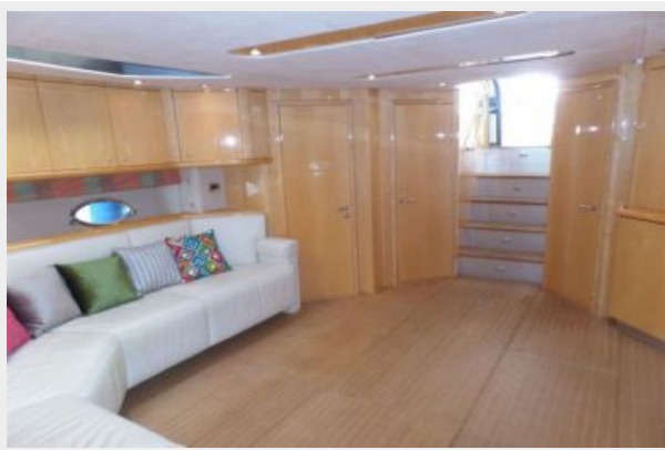
2004 Sunseeker Predator 68 - Saloon