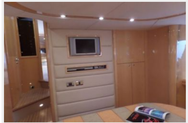
2004 Sunseeker Predator 68 - Master Cabin