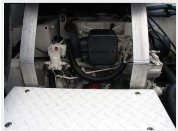
Electrical System / Equipment - Generator