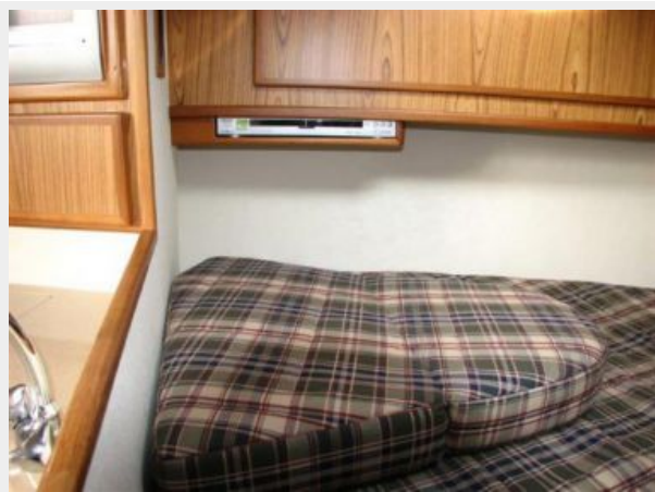
Main Cabin 3