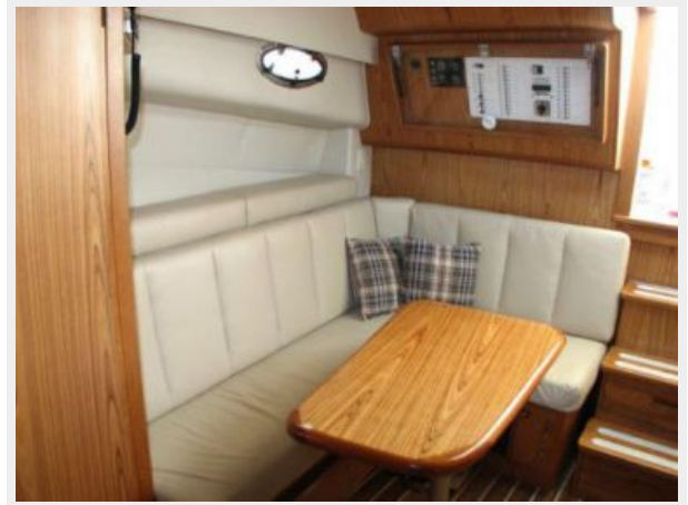
Main Cabin 2 - Dinette