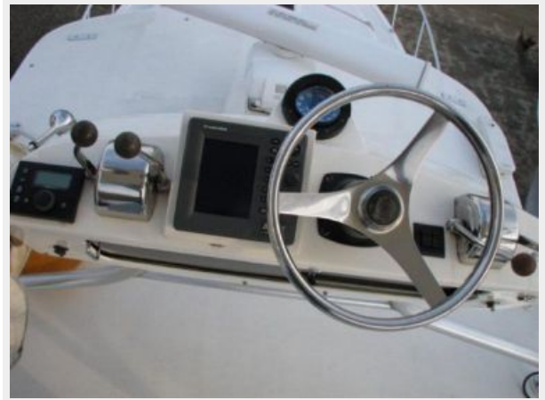
Helm / Electronics & Navigation 4 - Tower Controls