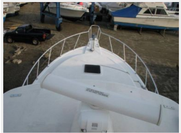
Deck 1 - Bow