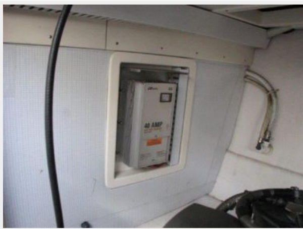
Engine & Mechanical Equipment 6