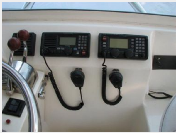
Helm / Electronics & Navigation 3