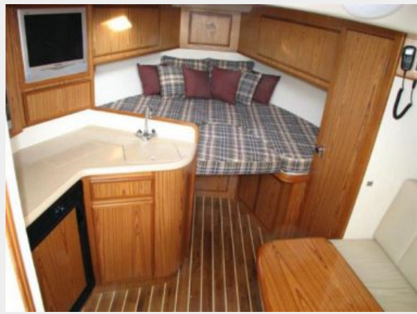
Main Cabin 1