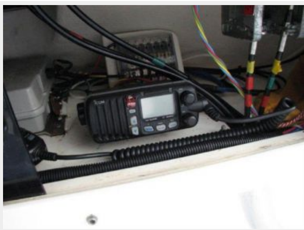
Helm / Electronics & Navigation 5 - Radio in Tower