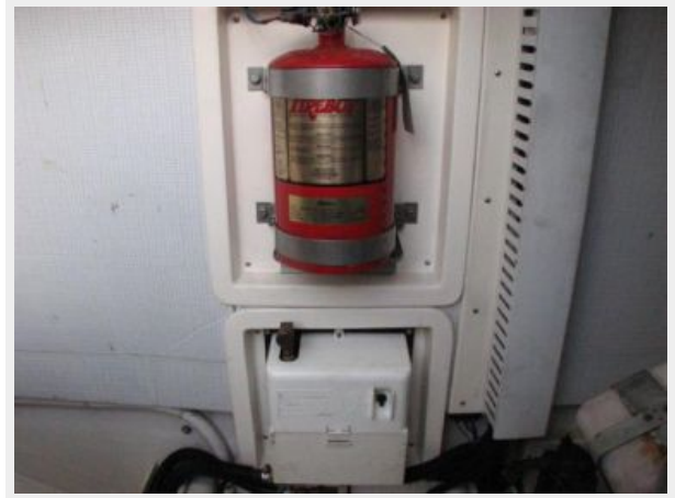
Engine & Mechanical Equipment 5