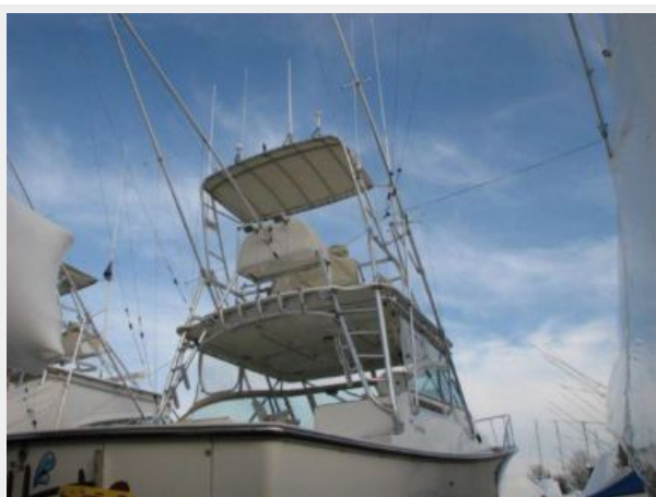
Deck 2 - Tower