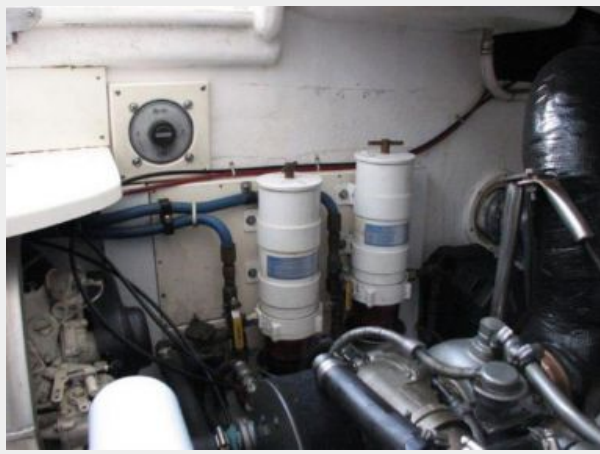
Engine & Mechanical Equipment 4