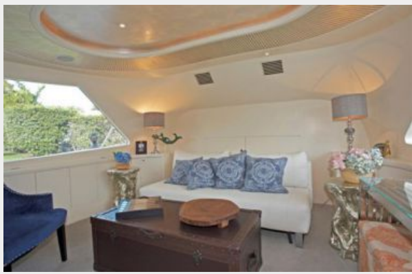
Media Room/4th Stateroom