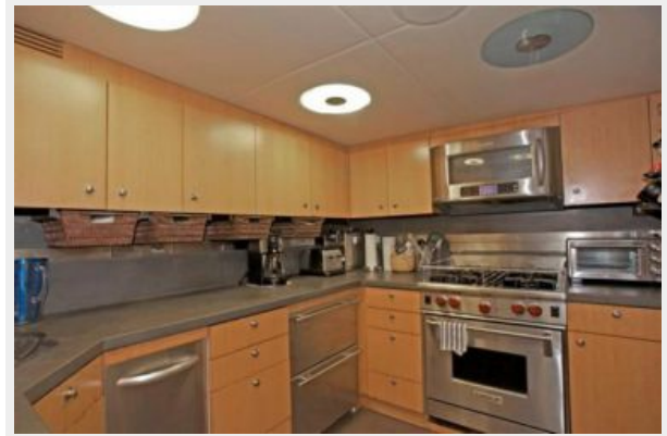
On Deck Galley