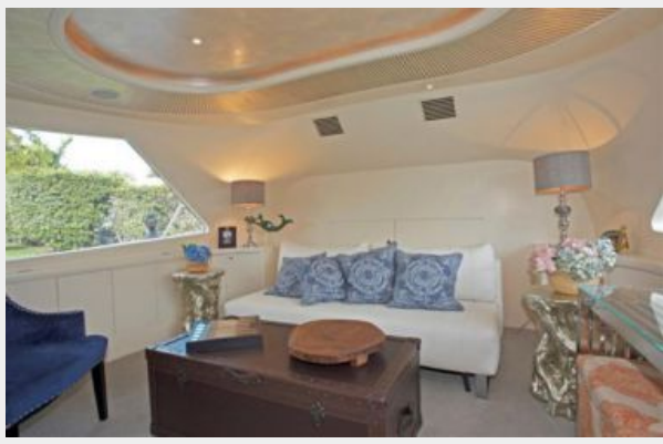
Media Room/4th Stateroom