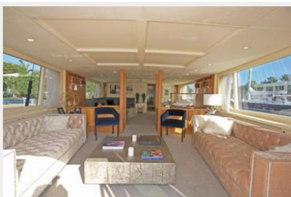
Aft Salon Looking Forward