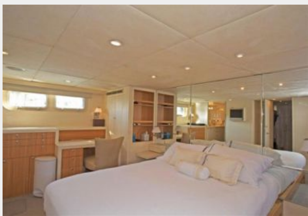
Master Stateroom Starboard