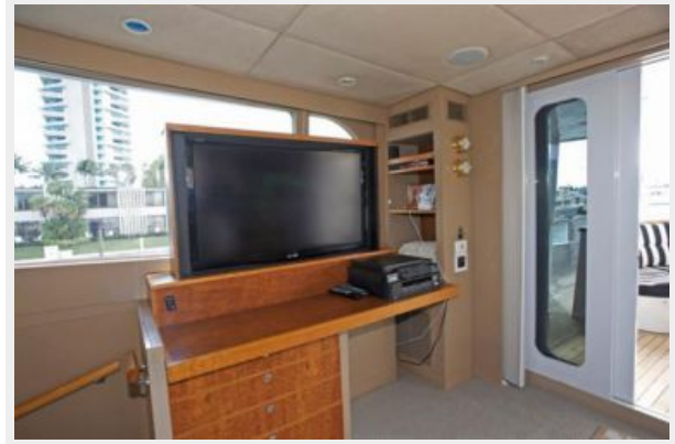
Sky Lounge TV