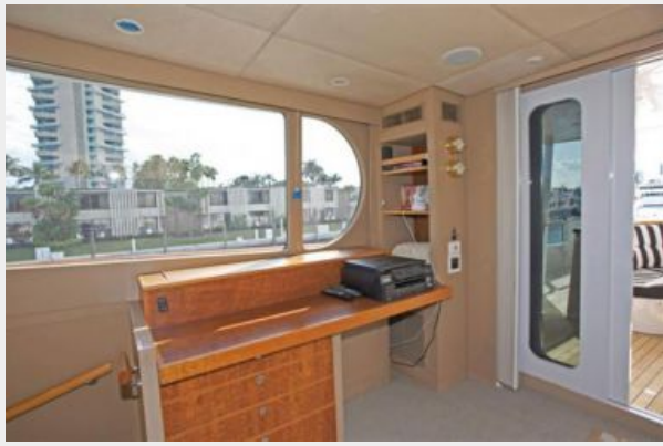
Sky Lounge Desk