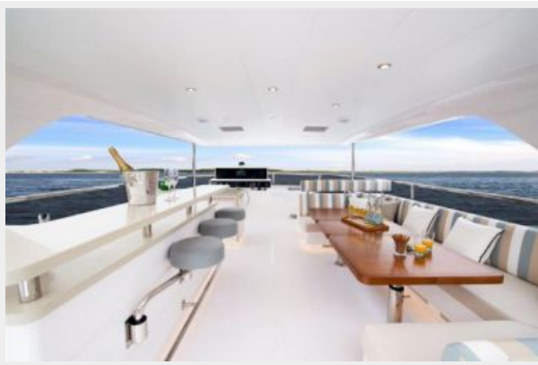
Flybridge forward view