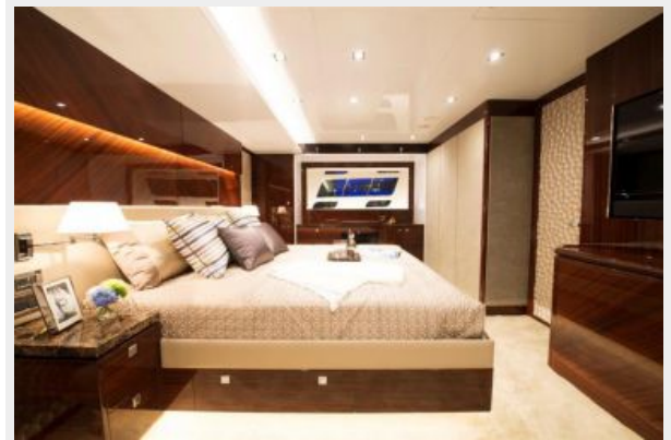
Master Stateroom III