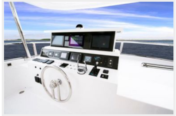
Exterior Flybridge helm