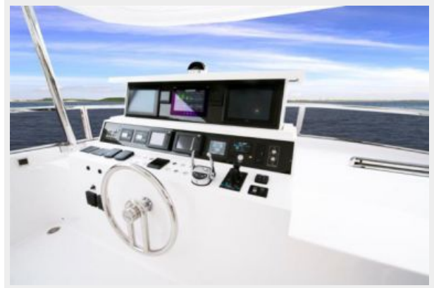
Exterior Flybridge helm