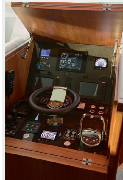
Mini lower helm detail