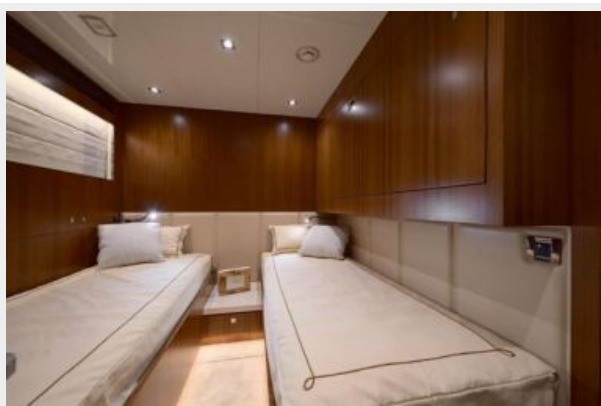
Stbd Twin Guest Stateroom