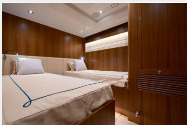
Port Twin Guest Stateroom