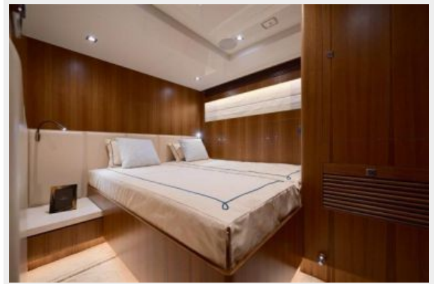
Port Twin Guest Stateroom (beds slid together)