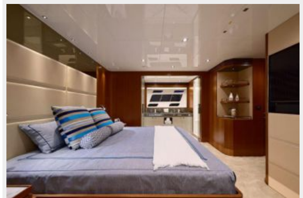
Master Stateroom II