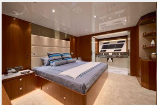
Master Stateroom & Head