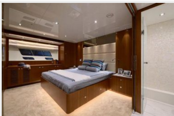
Master Stateroom III