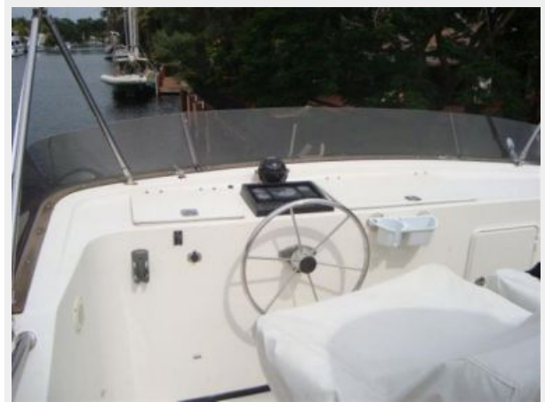
Upper - Helm - Instruments - Closed