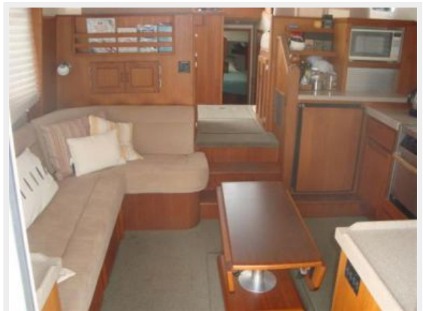
Salon- Forward View