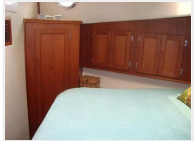
Master-3,, Storage - Port Side