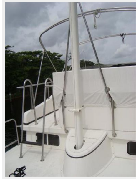
Folding radar mast