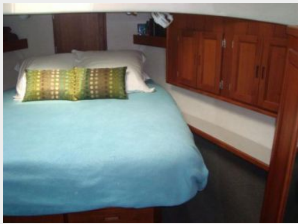
Master-2 -Storage Starbd Side