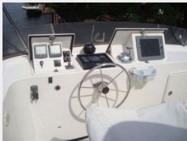
Upper - Helm - Instruments - Closed