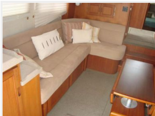
Salon- Forward View