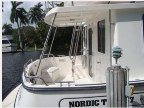
Folding radar mast