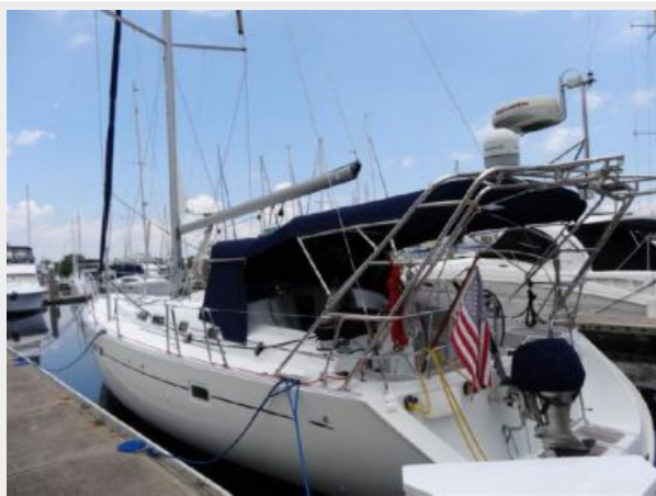
Port Stern Quarter