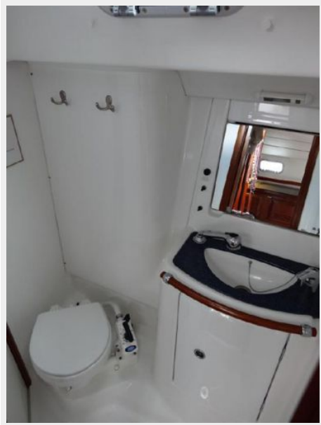
Guest Head With Shower