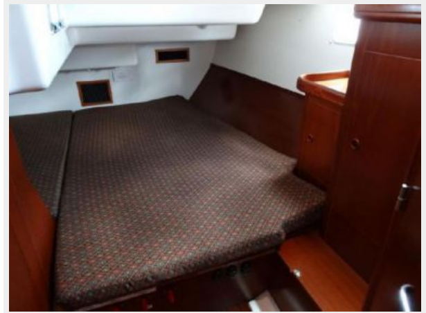
Aft Guest Stateroom