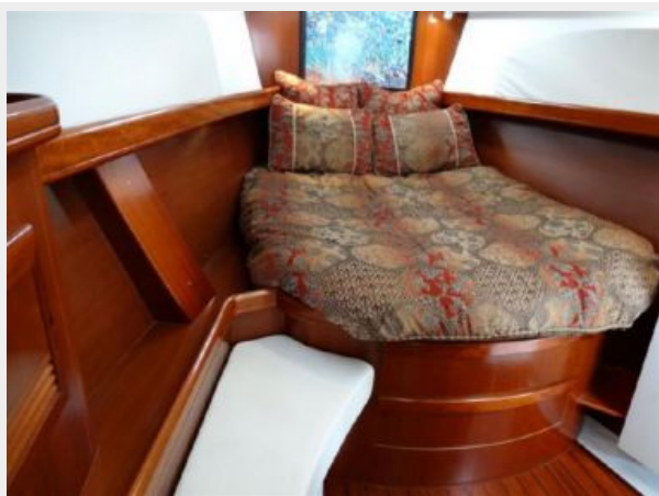
Owner's Stateroom With Island Queen