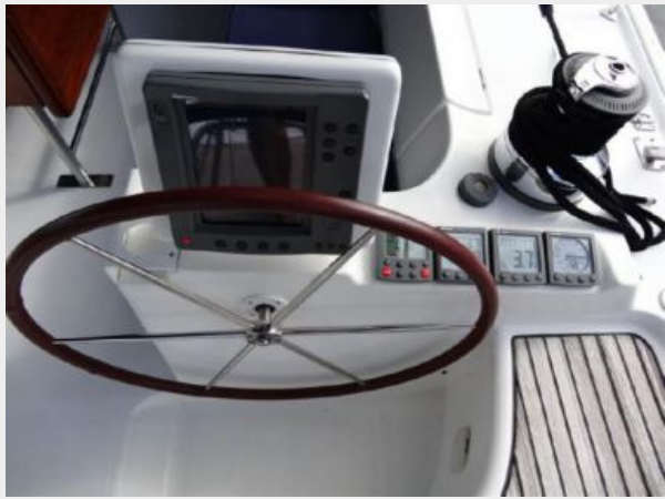
Starboard Helm With Large Plotter