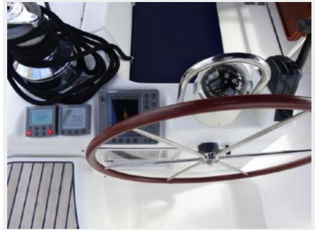
Port Helm With Plotter