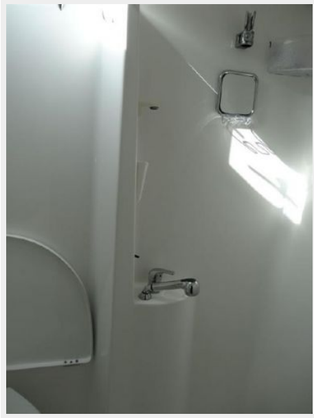
Owner's Ensuite Shower