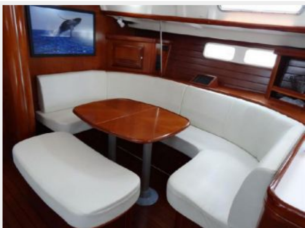
Starboard Salon Forward