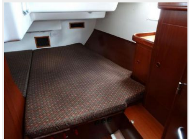
Aft Guest Stateroom