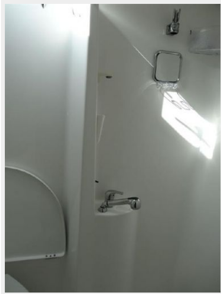
Owner's Ensuite Shower