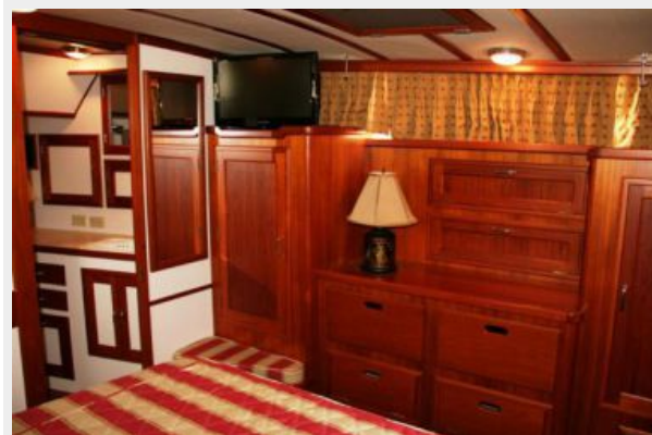
Master Cabin Forward