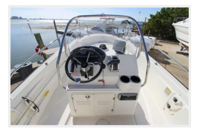
Center Console W/Stainless Grab Rail & Acrylic Windscreen