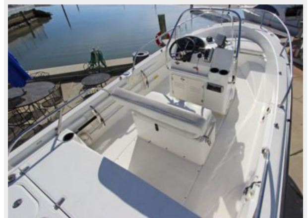
Clarion XMD3 Marine Stereo/CD Player