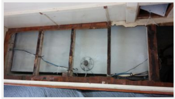
Port Fuel Tank