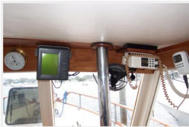
Lower Helm Electronics/VHF