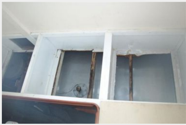
Starboard Fuel Tank