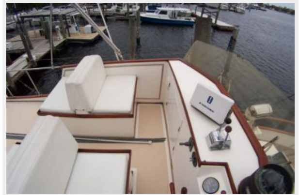
Flybridge Seating to Port