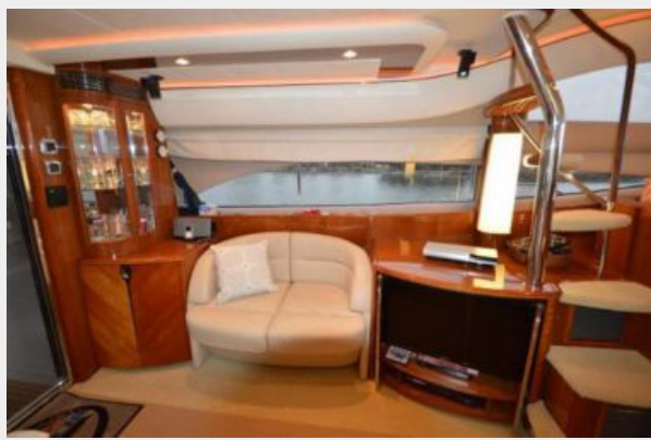
'03 Princess 61' FY: port side of lower salon; NEW TV