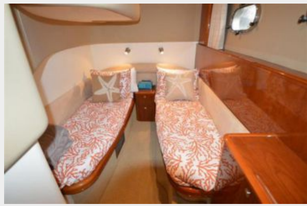
'03 Princess 61' FY: guest stateroom with new softgoods