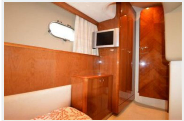
'03 Princess 61' FY: Sharp HDTV w/ DVD player in guest stateroom