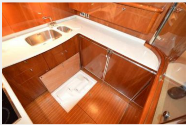
'03 Princess 61' FY: storage in galley sole