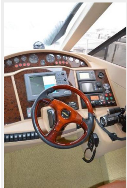
'03 Princess 61' FY: helm and electronics