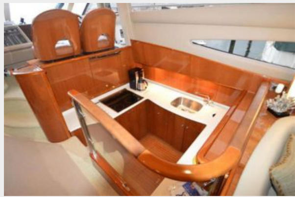
'03 Princess 61' FY: sunken galley