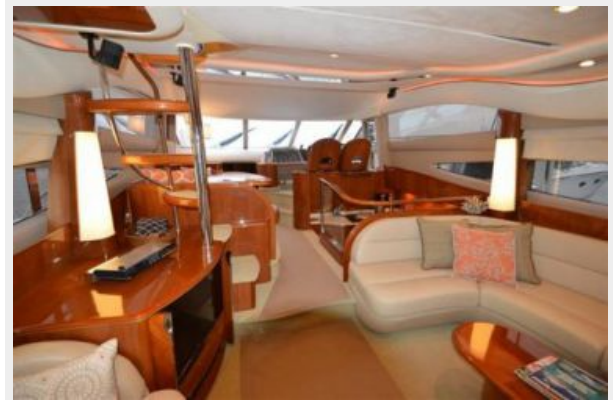
'03 Princess 61' FY: small refrigerator, convenient to cockpit