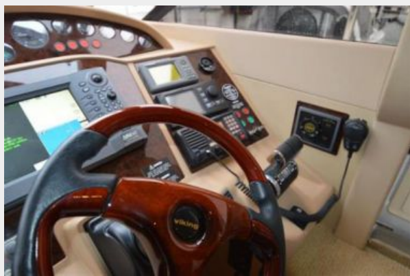
'03 Princess 61' FY: note the remote spotlight control pad