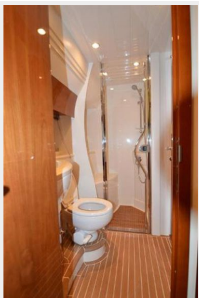
'03 Princess 61' FY: guest head with stand up shower