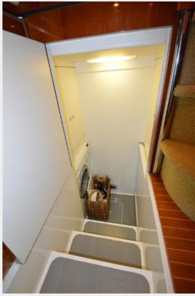
'03 Princess 61' FY: steps down to laundry and deep freezer