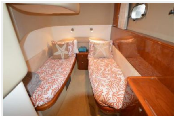
'03 Princess 61' FY: guest stateroom with new softgoods