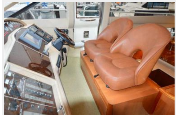
'03 Princess 61' FY: helmseats and stbd side door