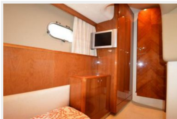
'03 Princess 61' FY: Sharp HDTV w/ DVD player in guest stateroom