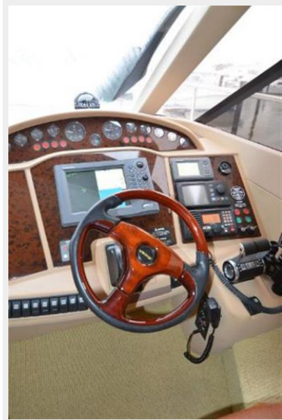
'03 Princess 61' FY: helm and electronics