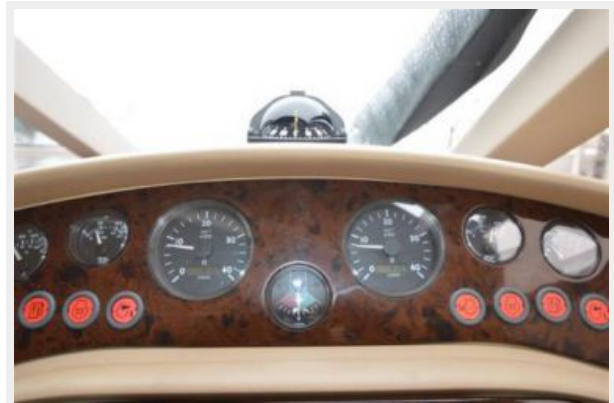
'03 Princess 61' FY: engine hour meters