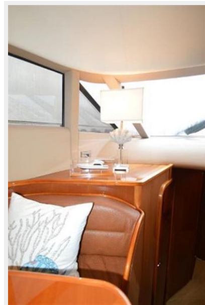
'03 Princess 61' FY: decor