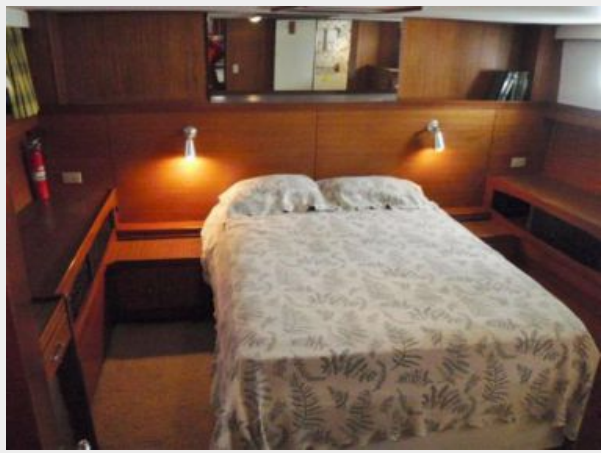
Master Stateroom Berth