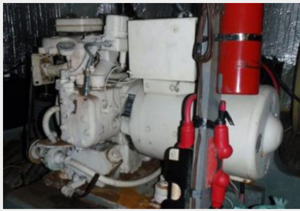
6kw Onan Generator