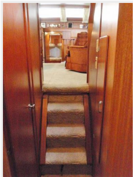
Master steps to Salon