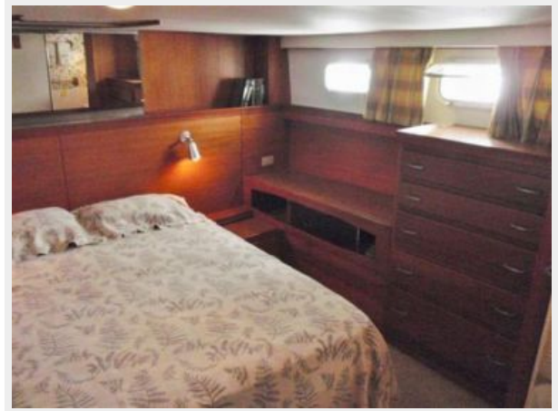
Master Berth Port