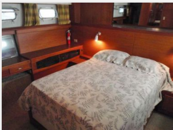
Master Berth Starboard