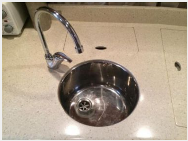
Stainless Steel Sink