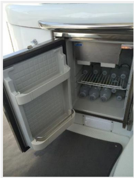
Port Wet Bar / Refrigerator