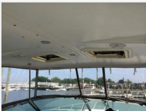
Sun roof / vents