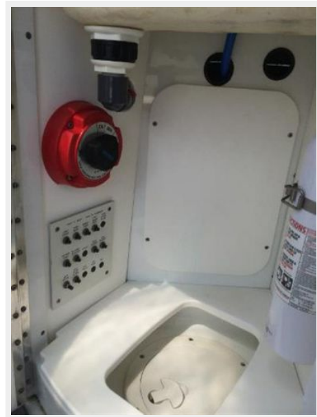
Under Port Wet Bar / Custom Trash Can Holder