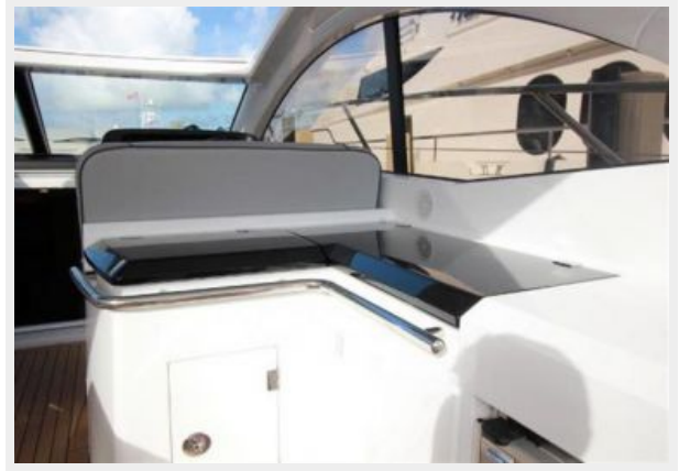
Bow Sun Deck