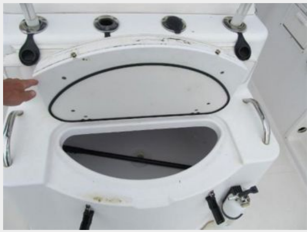
Live Well Tank