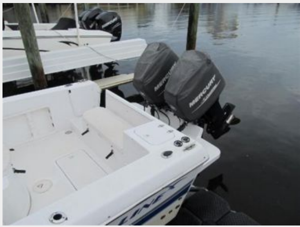
Motors With Covers