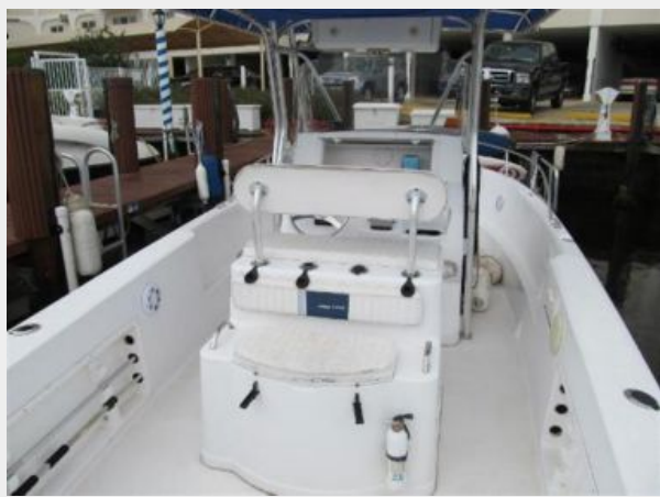
Leaning Post,Live well,Seat