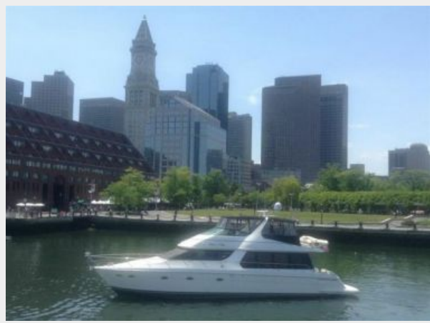
On The Water